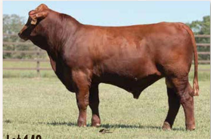
Lot 148 - QVF 190E 5369J17 ET