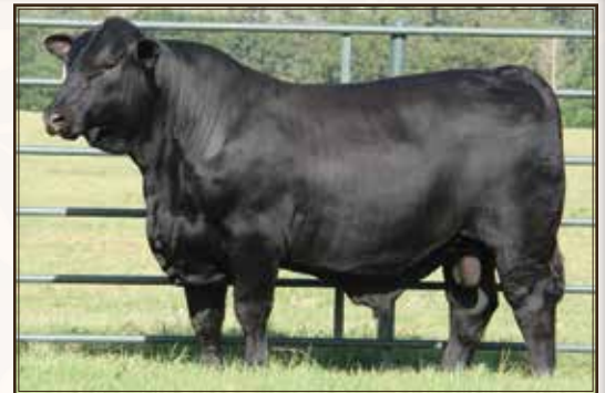
BWCC Papillon 458G Sire of Lot 4