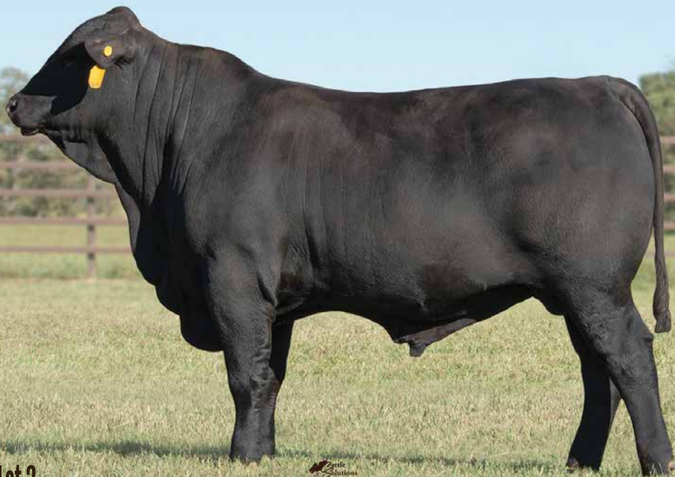
Lot 3 - ACE MILKY WAY 17J4