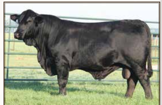
BWCC Merger 468F9 Maternal brother to Lot 4