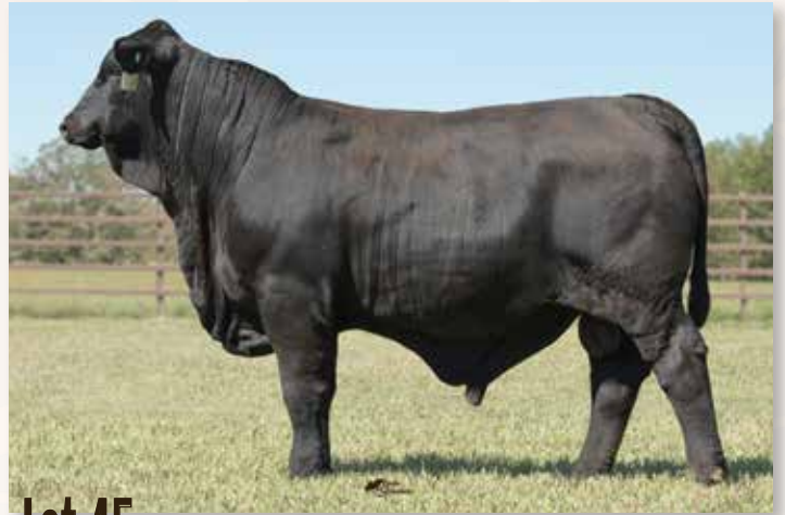
Lot 45 - QVF BROADWAY 468J75