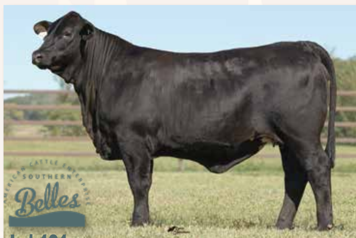
Lot 191 - MS SALACOA PRFCT FIT 535J48