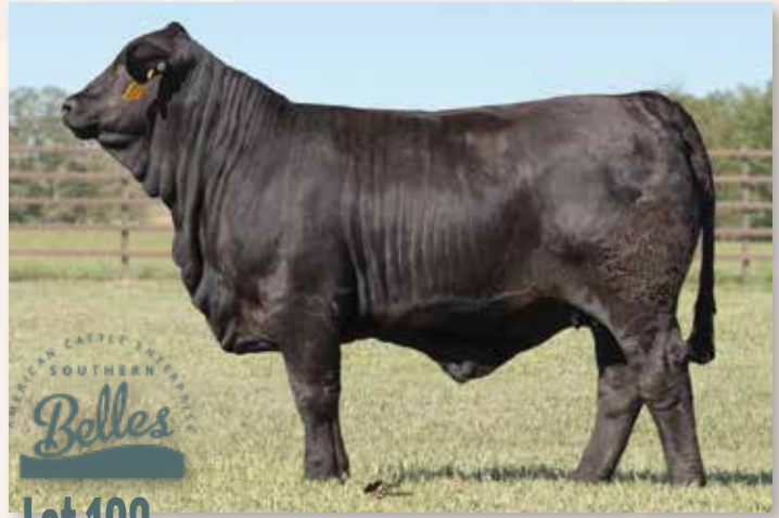
Lot 193 - QVF MS EMPOWER 594J