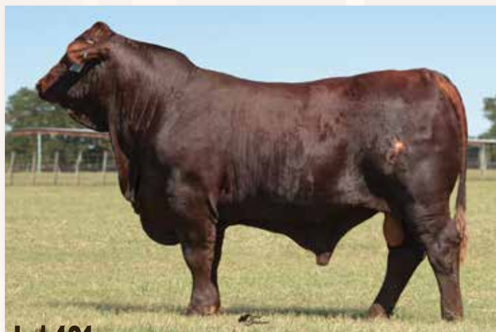
Lot 121 - WR OYSTER 107J

• WR Oyster 107J ranks in the top 1% for WW and 3% for REA.