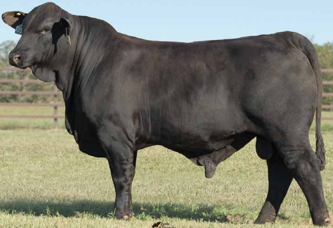
Lot 4 - VF INFERNO 468J52