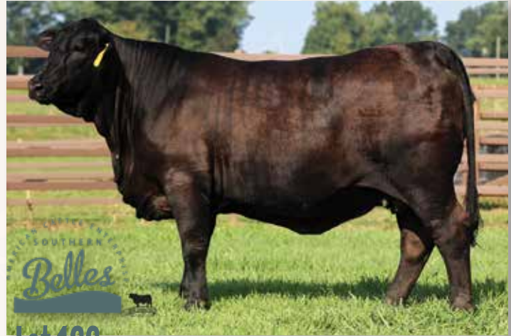
Lot 166 - MS DOUBLE S DOLLYWOOD 541H