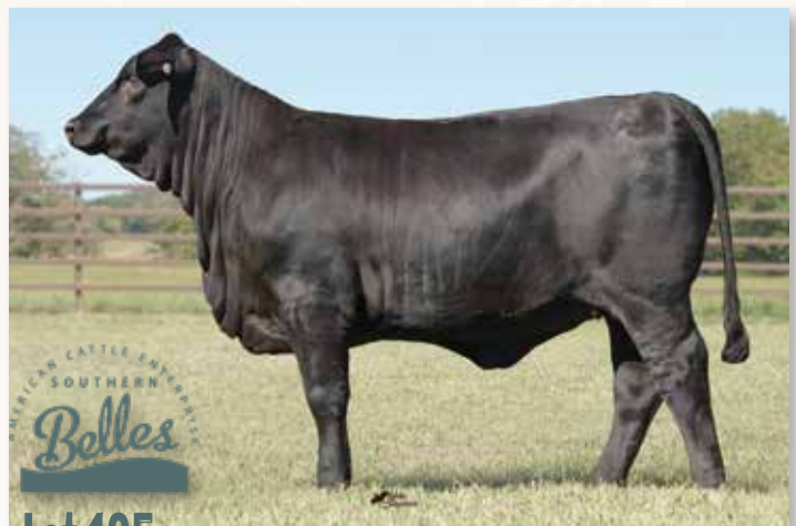
Lot 195 - QVF MS STRATEGY 803J13