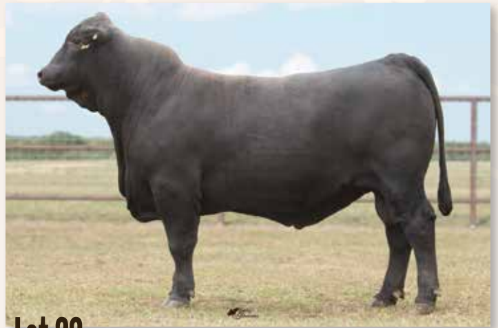
Lot 23 - CCR 415E2 ABSOLUTE 541J6