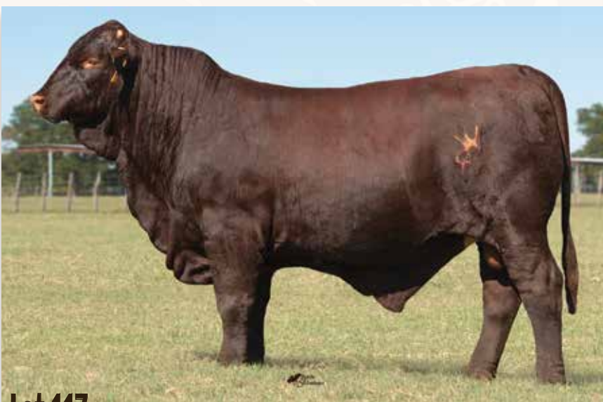
Lot 117 - WR NEXT CHAPTER 003J