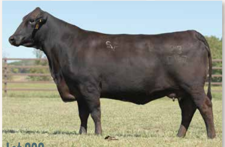
Lot 208 - MS SALACOA STONEWALL 23D47