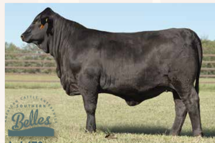
Lot 179 - QVF MS PERFECT FIT 23J17