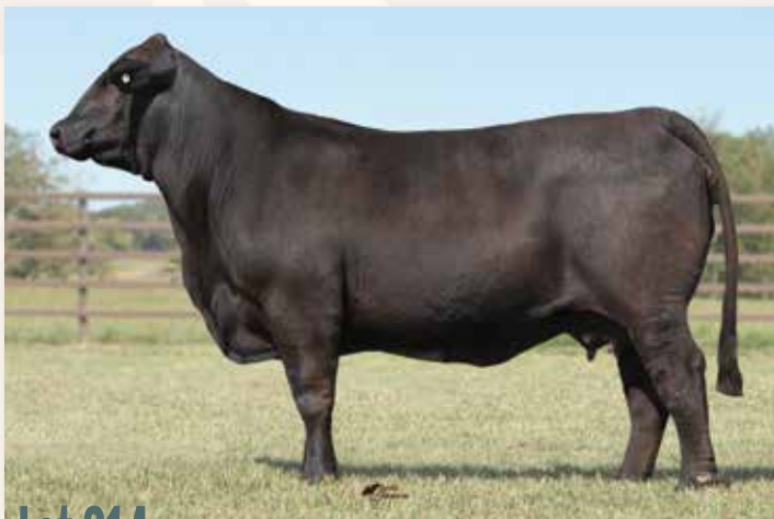
Lot 214 - MS SALACOA STONEWALL 75D