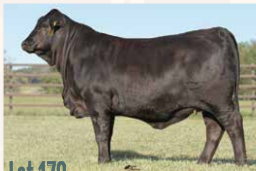
Lot 178 - QVF MS PERFECT FIT 23J15