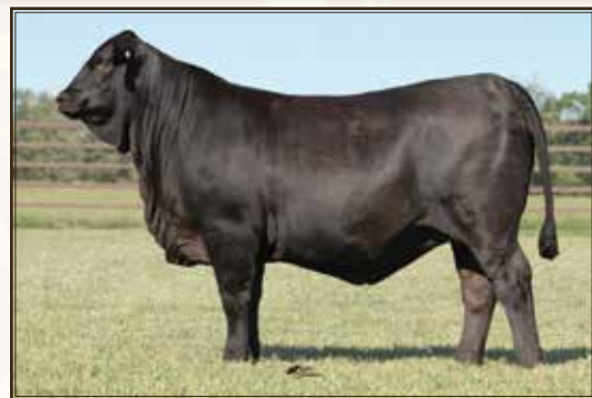
ACE Ms N Surrender 541J45 Full sister to Lot 2