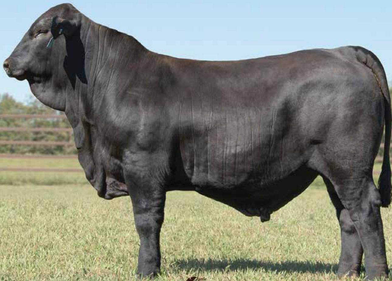
Lot 2 - ACE ALL IN 541J44