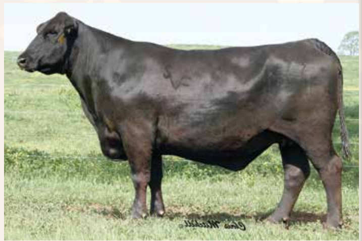
SVF MS 99P21 Dam of Lot 259

CSONKA OF BRINKS 30R4 STONEWALL OF RRR 222W6 R10150860 MS BRINKS LOMBARDI 222S20 BRINKS BRIGHT SIDE 607L11 SVF MS 99P21 R9695096 MISS BB NEW BIG EASY 99C9