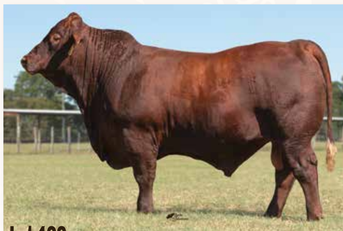
Lot 122 - WR MASSIVE 246J

• WR Massive 246J fits his name well. He should make tremendous daughters with a lot of volume and capacity. • He ranks in the top 15% for both Marbling and REA