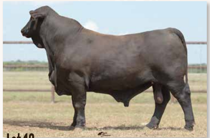
Lot 13 - QVF BLACK WARRIOR 535J3