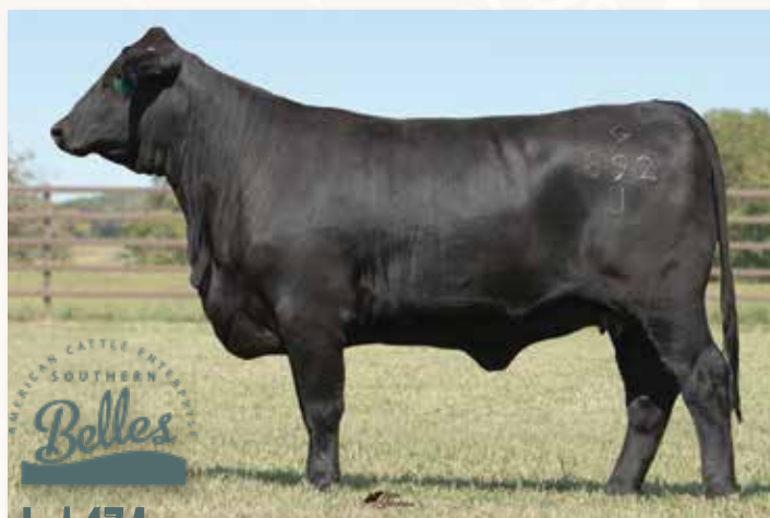
Lot 174 - GBF MS NEVER SURRENDER 892J