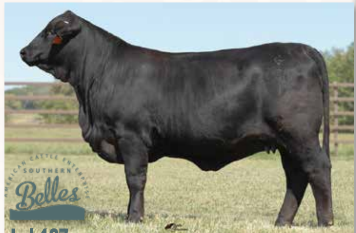
Lot 167 - GBF MS BIGTOWN 000J