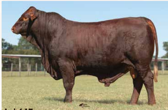
Lot 145 - WR 35/5 253J7