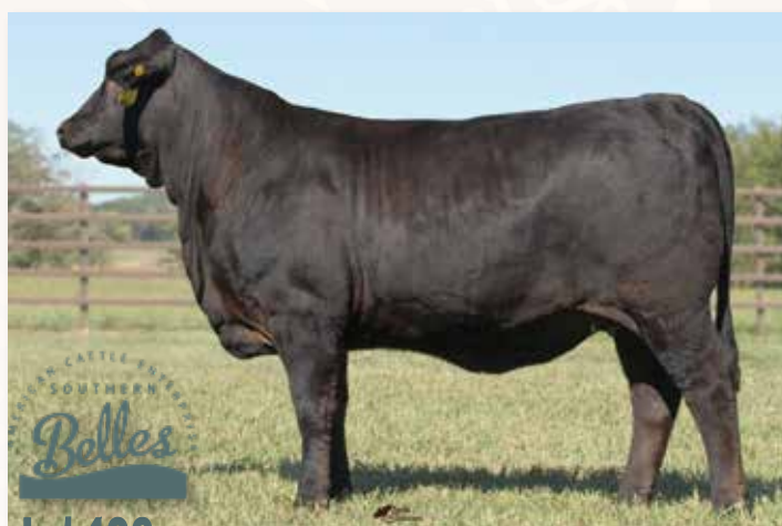
Lot 186 - ACE MS PERFECT FIT 392J19