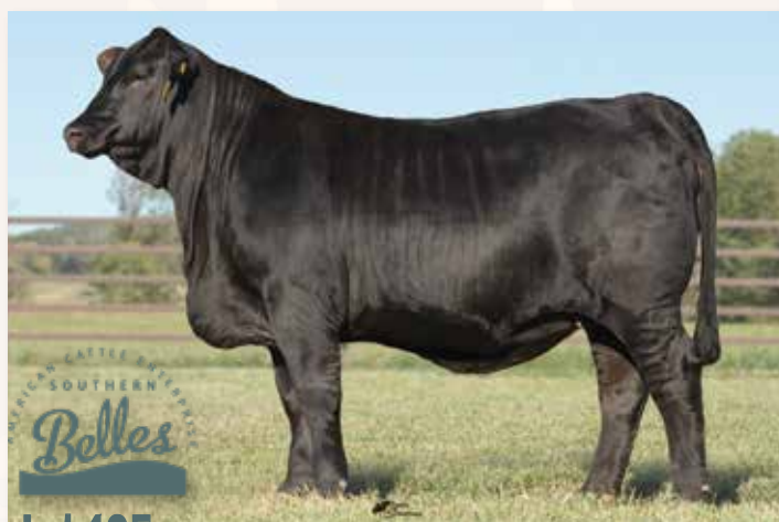
Lot 185 - ACE MS KINGDOM 209J40