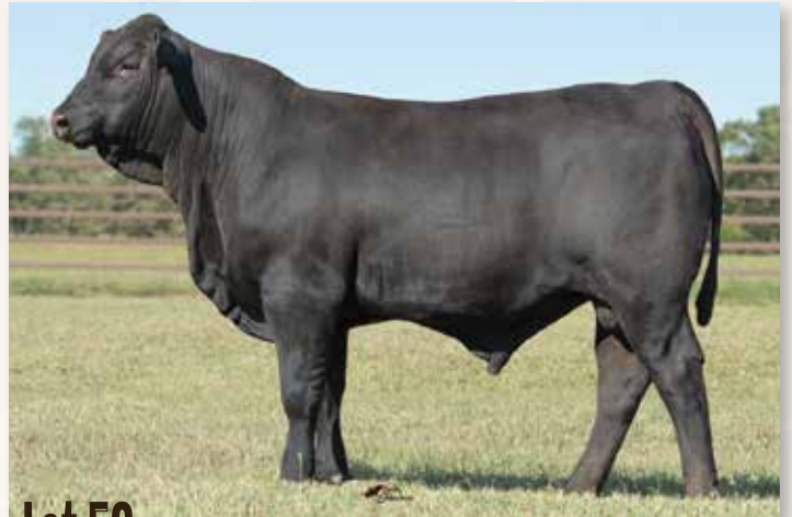
Lot 58 - ACE COBURN 468J49