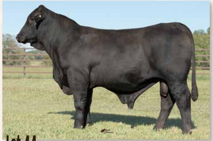
Lot 44 - VF BIG LAKE 468J72