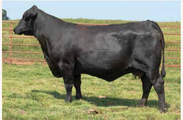
MS SALACOA STONEWALL 99B7 Daughter of Lot 217