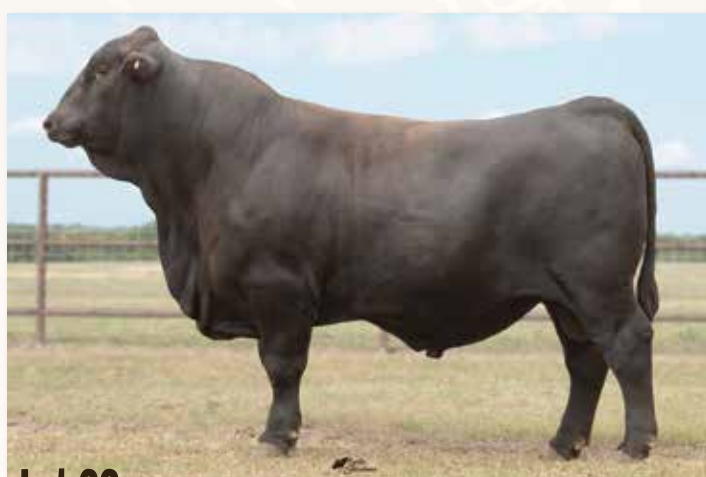
Lot 22 - SALACOA N SURRENDER 23J31