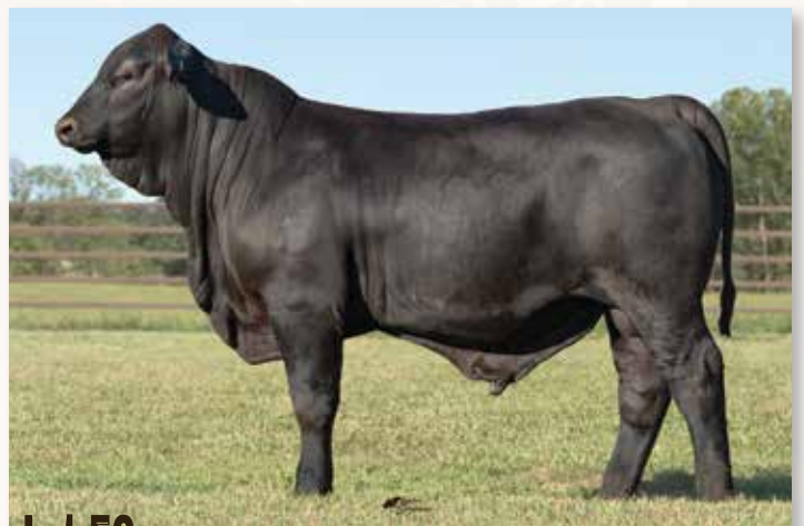
Lot 59 - GBF ATLANTA 541J5