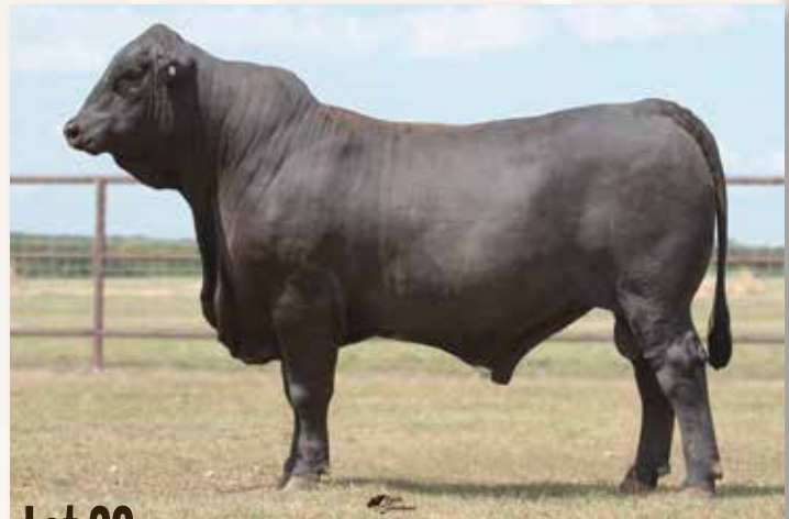
Lot 28 - G&R EMPIRE 406J