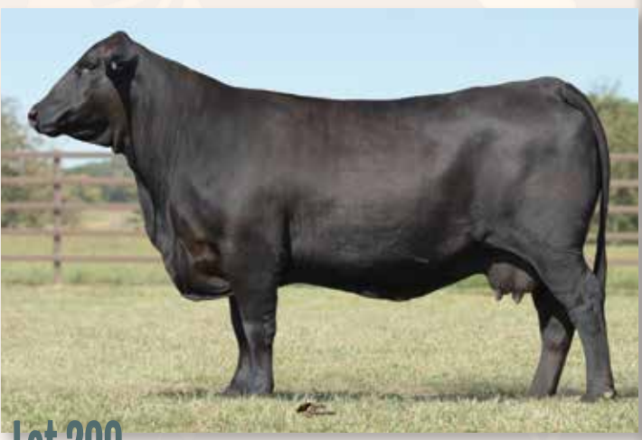
Lot 209 - MS SALACOA STONEWALL 23D5