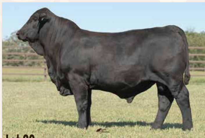
Lot 20 - ACE PICTURE PERFECT 111J23