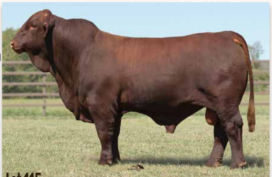
Lot 115 - TF GENTRY J023