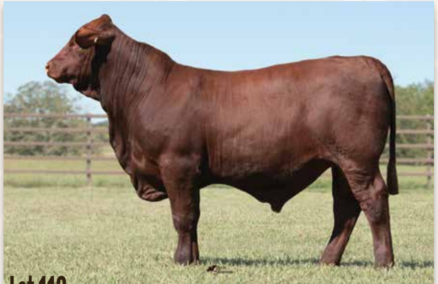
Lot 118 - QVF LEGACY 82J