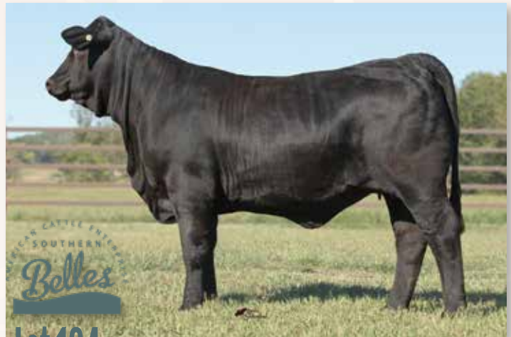
Lot 194 - QVF MS PERFECT FIT 803J11