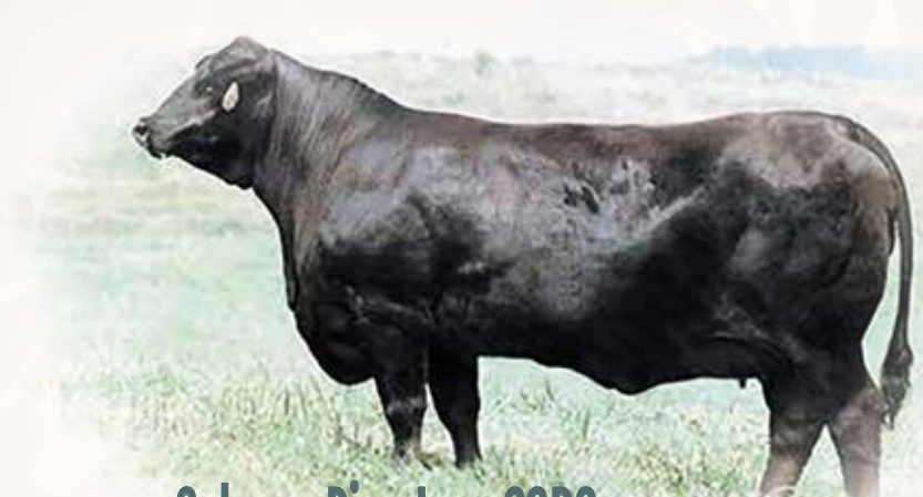
Salacoa Pine Lass 23D2 - THE MATRIARCH