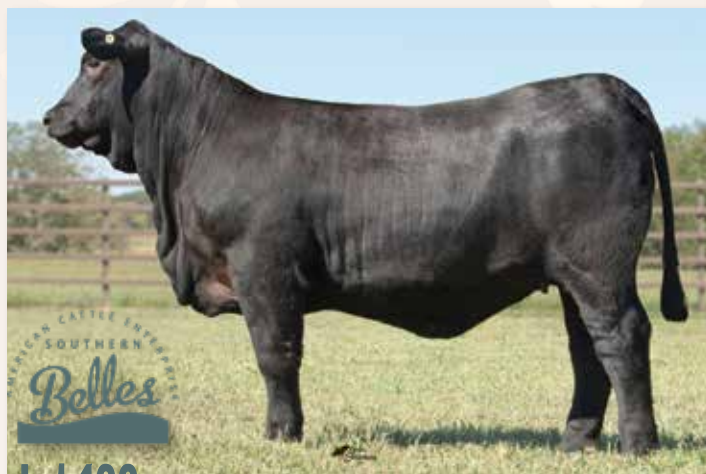
Lot 190 - ACE MS CRUISE 535J45