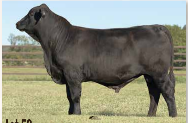
Lot 52 - ACE SOUTHERN COMFORT 7926J