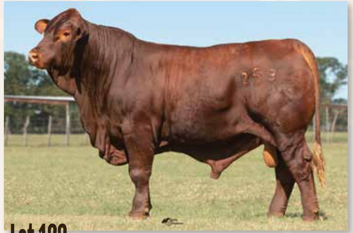
Lot 123 - WR PRIDE 253J