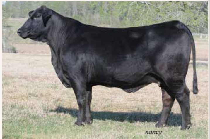
MS BRINKS DITKA 99S28 Dam of Lot 260

LAMBERT OF BRINKS 317R3 ATLANTA OF SALACOA 488Z R10210625 MS SVF CADENCE 488X11 DITKA OF BRINKS 535N37 MS BRINKS DITKA 99S28 R10046072 MS BRINKS SUNDANCE 99P12