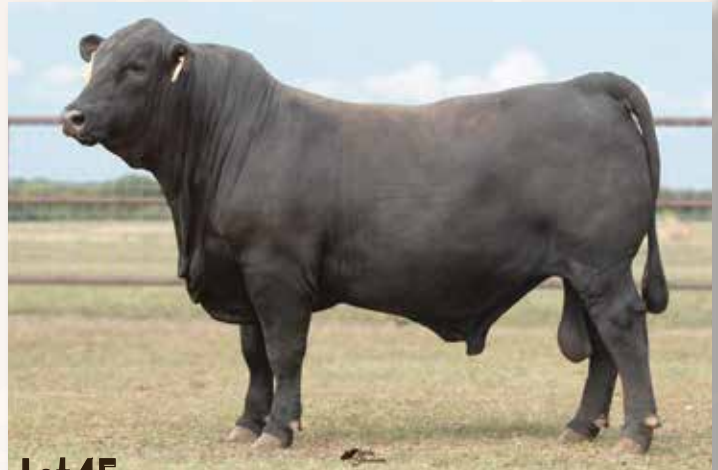
Lot 15 - CCR PLATINUM 541J