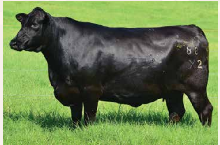
COLD CREEK MS LARGENT 88X2 Maternal granddam of Lot 168