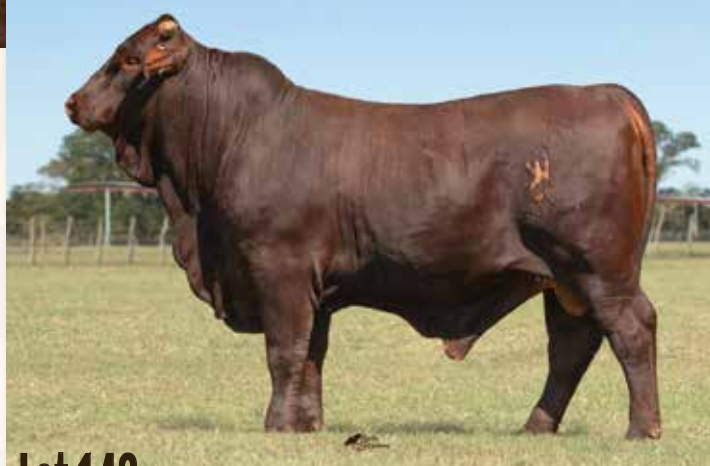
Lot 143 - WR 35/5 9J