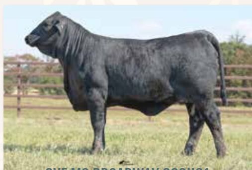
QVF MS BROADWAY 803H31 Daughter of Lot 269