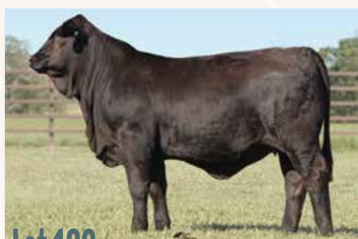
Lot 180 - QVF MS PERFECT FIT 23J20