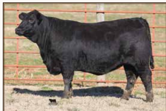
Ms Salacoa N Surrender 17H5 Maternal sister to Lot 3