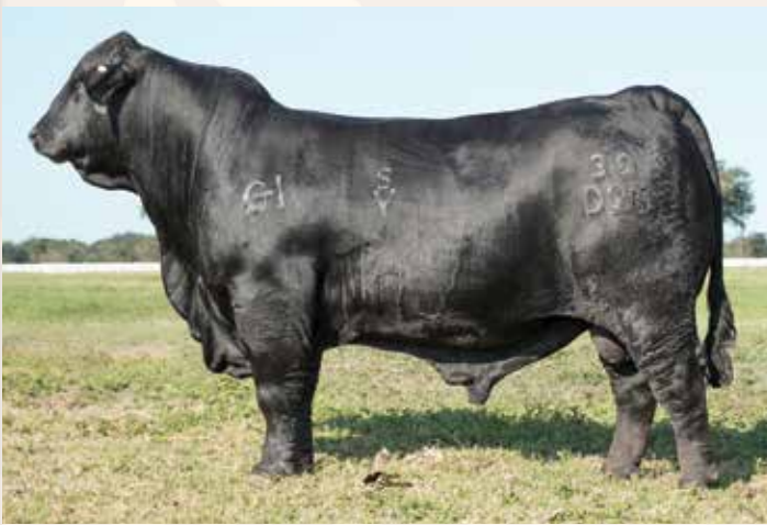
SUHN'S BUSINESS LINE 30D26 Sire of Lot 198, 199 & 200