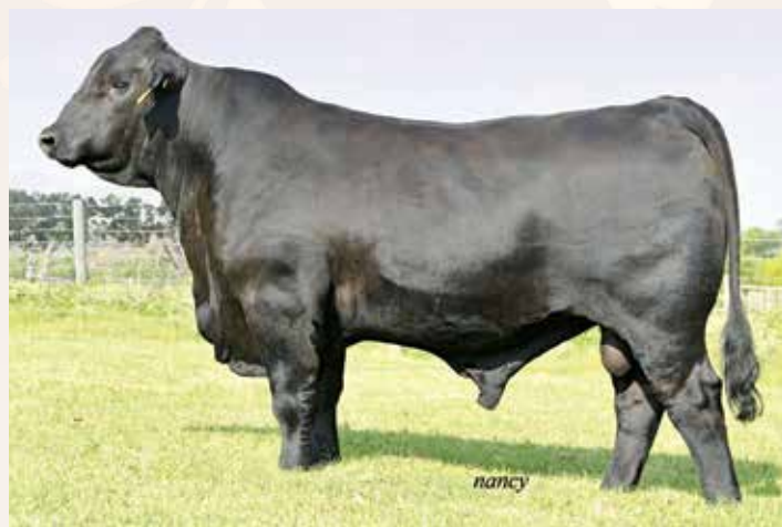
LTD OF BRINKS 415T28 Maternal grandsire of Lot 172