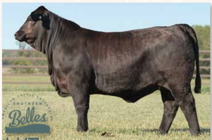
Lot 177 - QVF MS PERFECT FIT 23J14