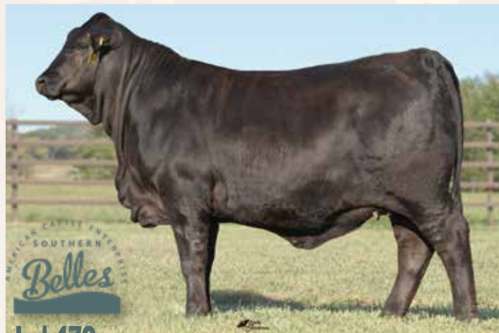
Lot 178 - QVF MS PERFECT FIT 23J15