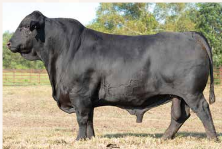
TINSELTOWN OF SALACOA 468D4 Sire of Lot 171 & 173