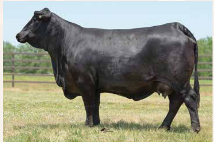
MS SALACOA BOULDER 541D6 Sister to Lot 229