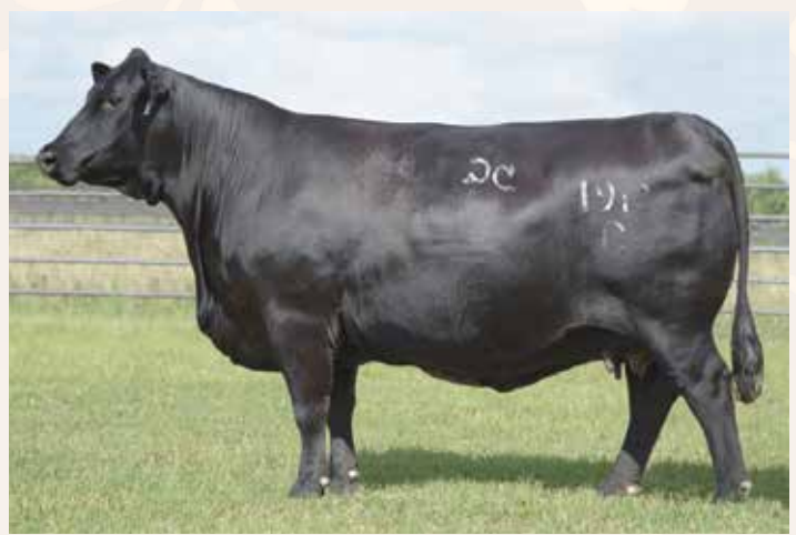
COLD CREEK LADY PASSPORT 1912C Maternal granddam of Lot 175