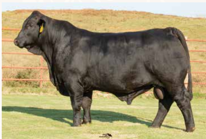
PERFECT FIT OF SALACOA 468G57 Sire of Lot 232A