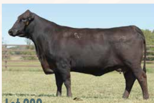
Lot 208 - MS SALACOA STONEWALL 23D47