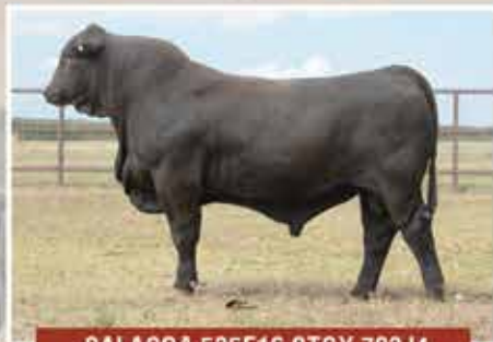
SALACOA 535F16 STGY 793J4 STRATEGY X BIG TOWN