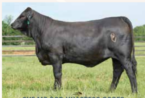
QVF MS 99D HUASTECO 803F2 Daughter of Lot 269