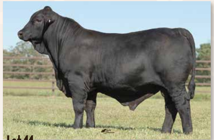
Lot 11 - ACE OTTOMAN 99J31