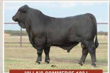
VILLA'S COMMERCE 103J WALL STREET X BOTTOMLINE