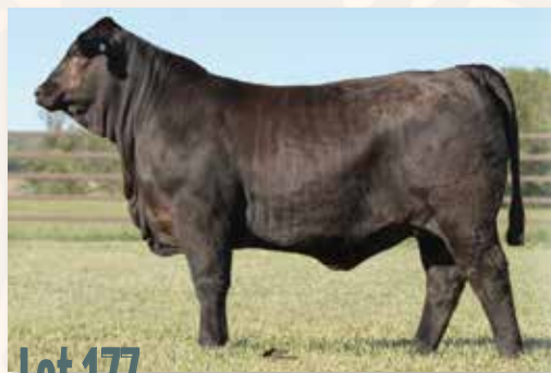
Lot 177 - QVF MS PERFECT FIT 23J14

We are so proud to feature and celebrate the “Salacoa 23” cow family by offering a great set of “23” females and this year’s sale.