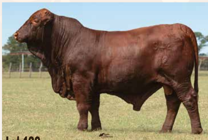
Lot 120 - WR SUPREME 34J2

• WR Supreme 34J2 is a deep sided, deep flank, big boned bull.