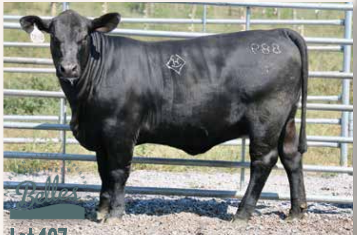
Lot 197 - HH MS CHISELED 889J