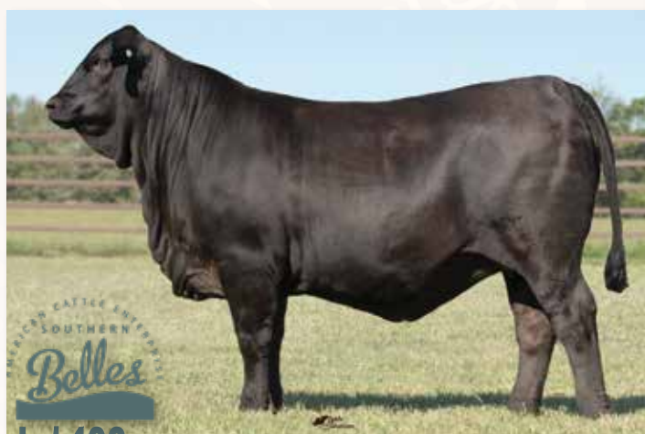
Lot 192 - ACE MS N SURRENDER 541J45