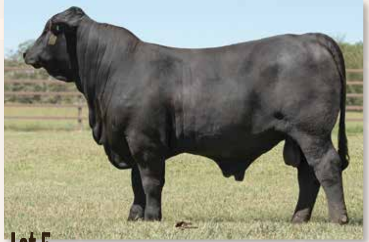
Lot 5 - VF LE MANS 468J64