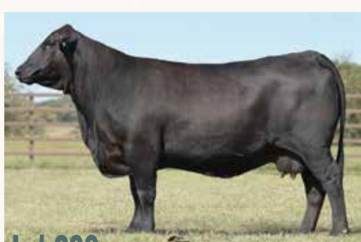
Lot 209 - MS SALACOA STONEWALL 23D5