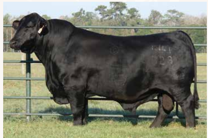
BWCC CROSS FIT 541B28 Paternal grandsire of Lot 189