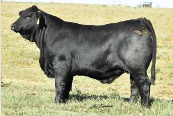
MS SALACOA NEW VISION 541D22 Sister to Lot 229