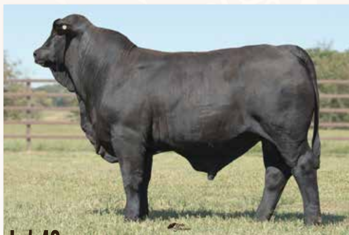
Lot 49 - G&R NEVER SURRENDER 000J5