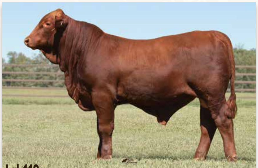
Lot 119 - QVF HIGH COTTON 37J4