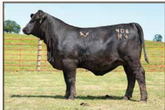
Ms Salacoa 535F14 STGY 406H4 Maternal sister to Lot 1