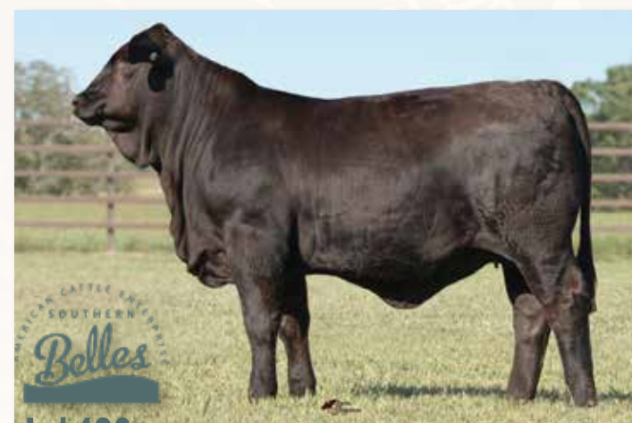
Lot 180 - QVF MS PERFECT FIT 23J20