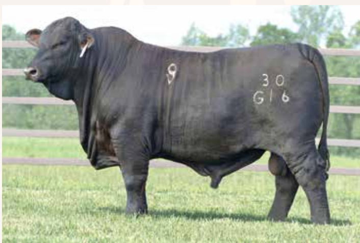
QVF PR EMPOWER 30G16 Sire of Lots 212A, 214A & 215A