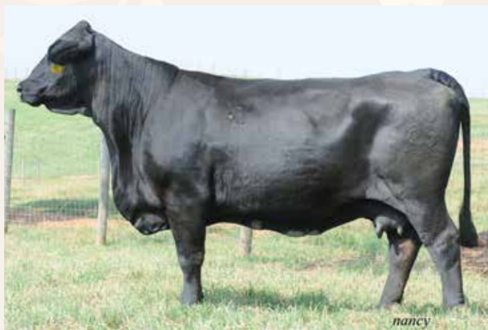
MS BRINKS LOMBARDI 803S25 Dam of Lot 231