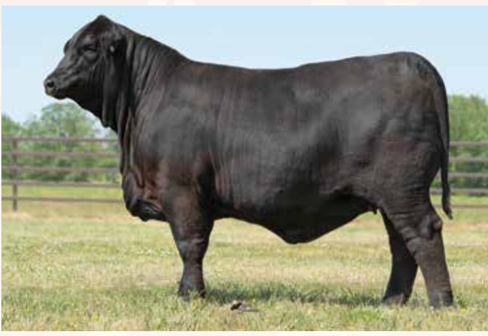
MS SALACOA EMPIRE 23J21 Daughter of Lot 209