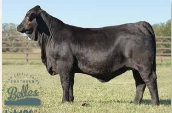
Lot 181 - QVF MS PERFECT FIT 23J21 ET