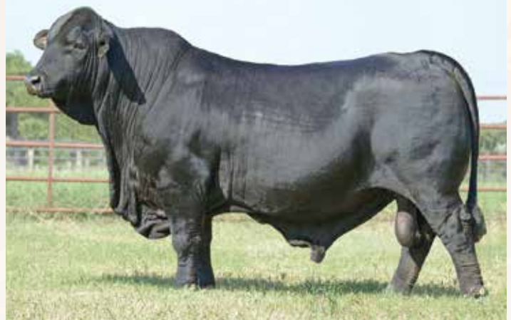
DMR EMPIRE 795D12 Paternal grandsire of Lot 176