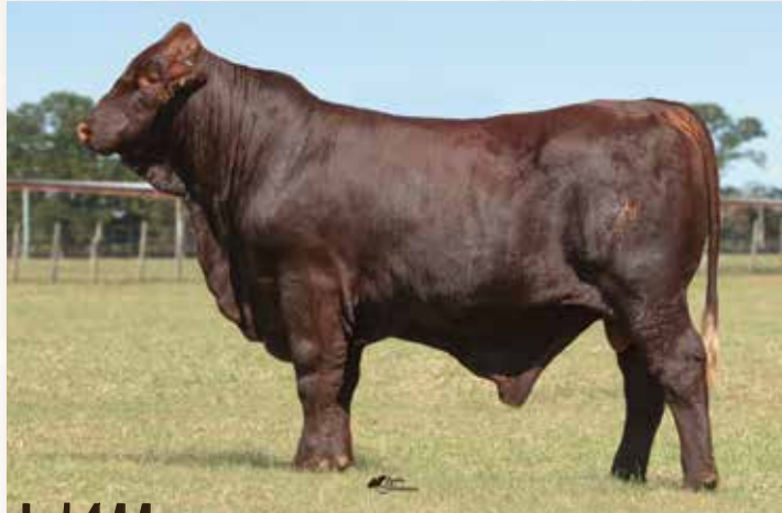
Lot 144 - WR CHECKMATE 024J