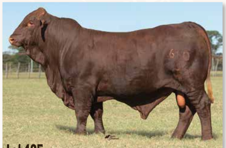
Lot 125 - WR COMBINE 680J