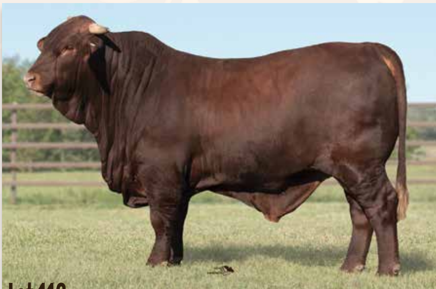
Lot 116 - TF COOK 4139H3