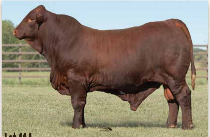
Lot 114 - TF OWENS J036