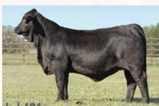
Lot 181 - QVF MS PERFECT FIT 23J21