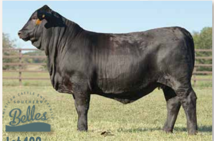
Lot 182 - ACE MS CRUISE 30J35