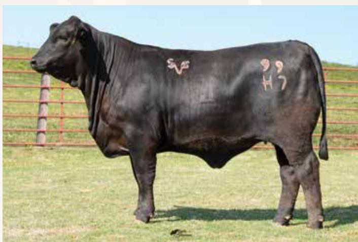
MS SALACOA ATLANTA 99H7 Dam of Lot 227A & 228A