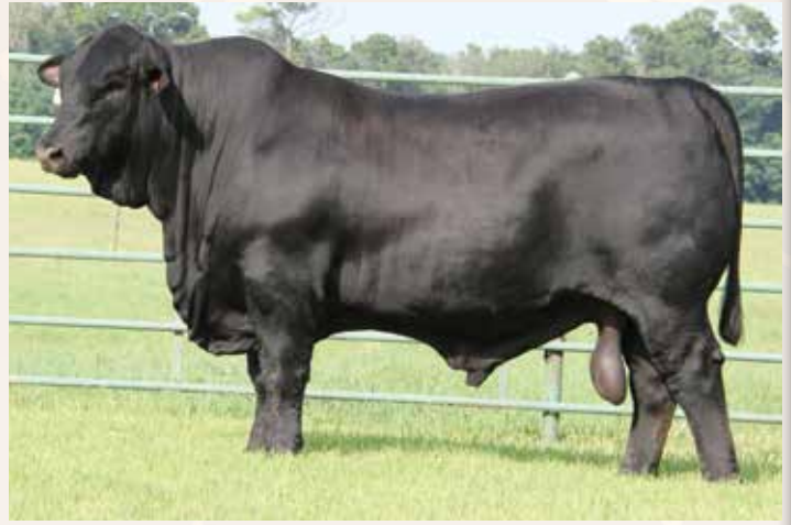
BWCC BIG TOWN 192B16 Sire of Lot 196