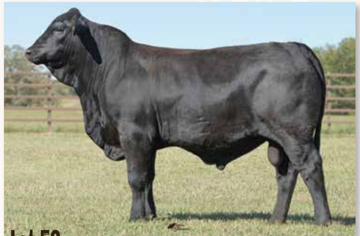
Lot 53 - ACE MCQUEEN 111J24