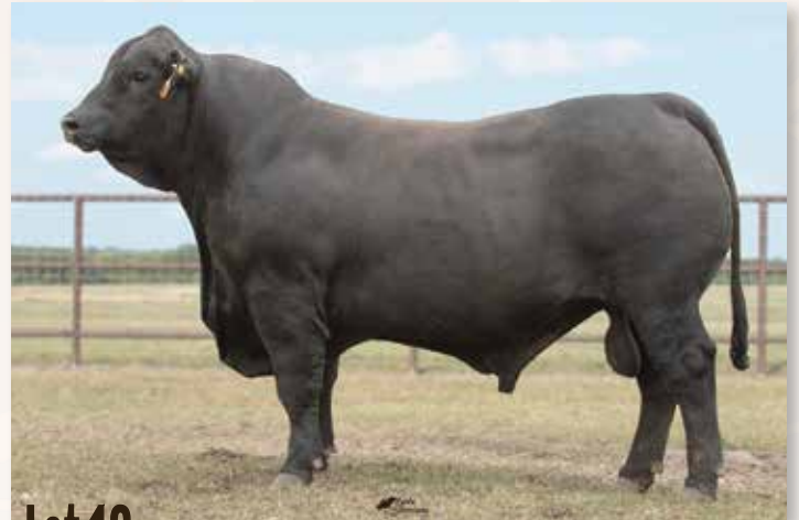
Lot 18 - FLOWING CASH 263J