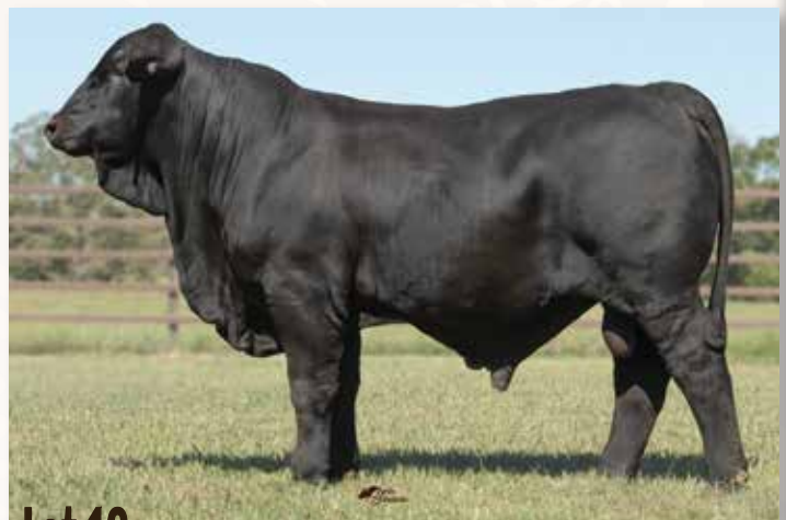
Lot 10 - ACE PORTER 99J51