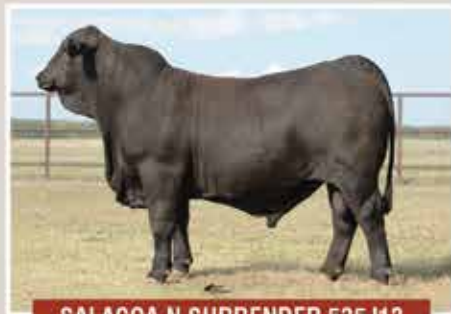
SALACOA N SURRENDER 535J12 NEVER SURRENDER X AMERICUS

PLEASE JOIN US - FRIDAY, DECEMBER 9, 2022 – CATTLEMAN'S FIELD DAY AND DINNER – CAROLETA RANCH