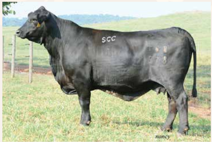
MS BRINKS BS 607L11 468S78 Dam of Lot 220