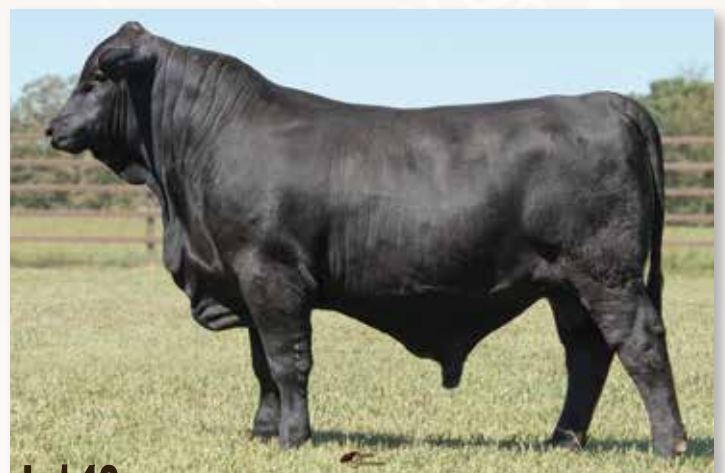
Lot 19 - CCR GOLDEN BOY 1912J7