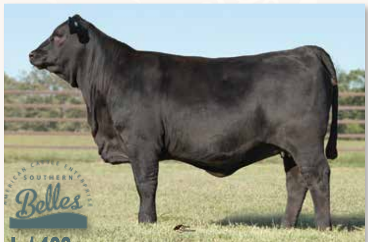
Lot 183 - ACE MS BIG LAKE 71J4