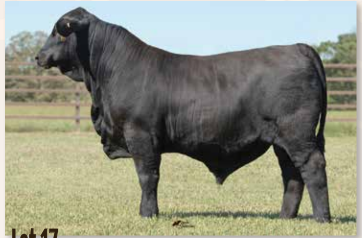
Lot 17 - VF TRIGGER 000J10