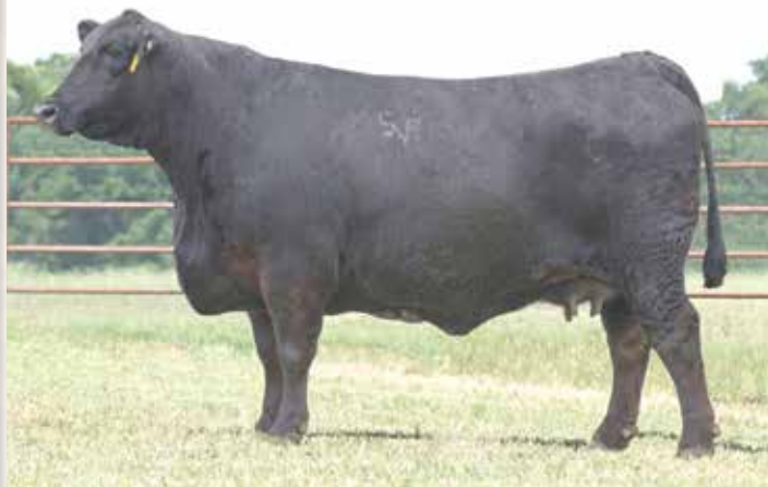
MS SALACOA TOP PRODUCT 209C5 Dam of Lot 220A