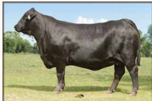
T3 Ms Csonka 541B21 Dam of Lot 2