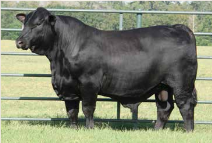
BWCC PAPILLON 458G Sire of Lot 187 & 188