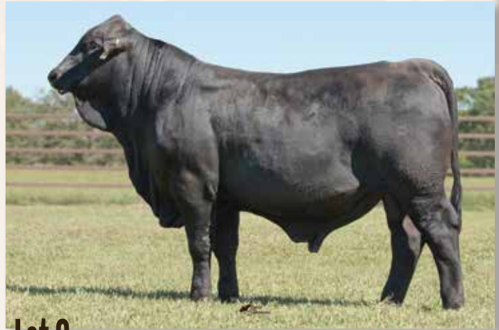
Lot 8 - QVF BIG APPLE 30J74