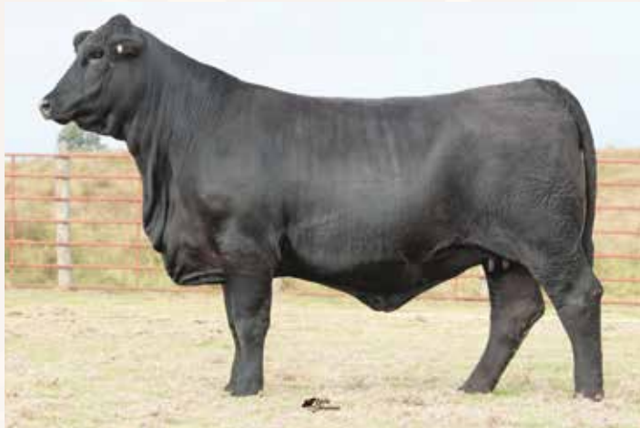
MS SALAGOA N SURRENDER 209G71 Dam of Lot 222A