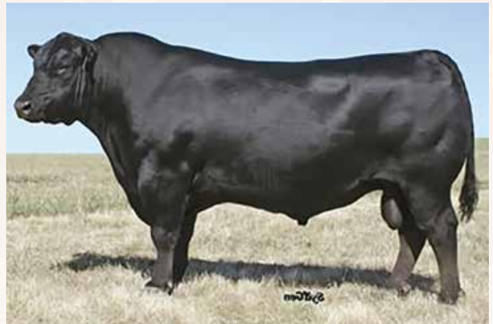
SYDGEN C C & 7 Paternal grandsire of Lot 170