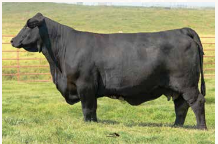
MS SOUTHERN JOHN WAYNE 240W21 Paternal granddam of Lot 208A