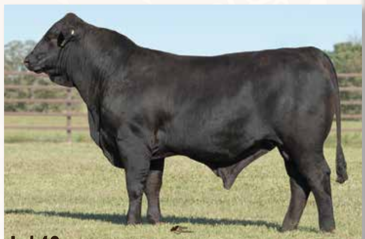
Lot 16 - VF TAKE OVER 889J2