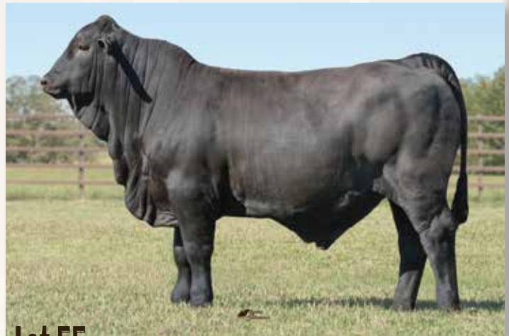
Lot 55 - ACE N SURRENDER 209J68