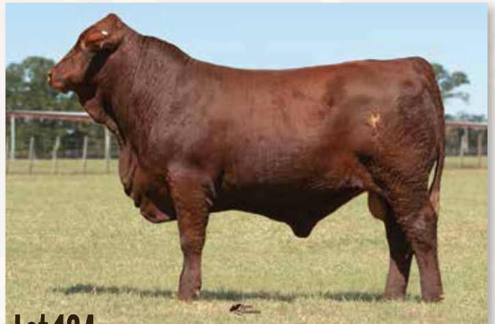
Lot 124 - WR ROW CROP 533J