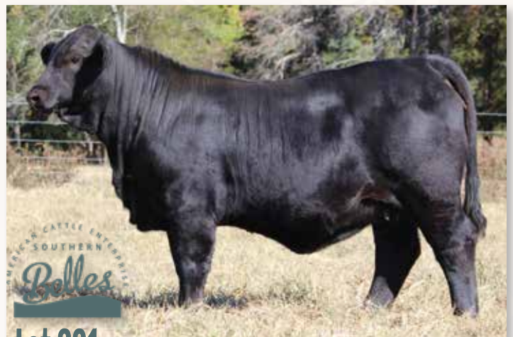
Lot 201 - DS MS EMPOWER 107K