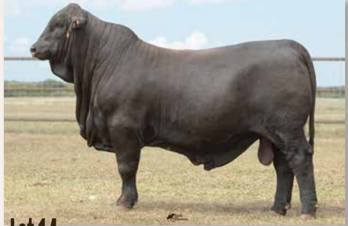
Lot 14 - QVF BLACK CAT 535J5