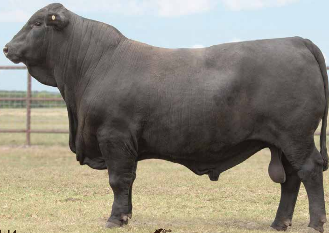
Lot 1 - ACE OF SPADES 406J