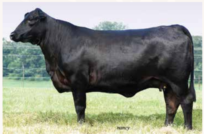
MS BRINKS GD FORTUNE 541P96 Maternal granddam of Lot 171