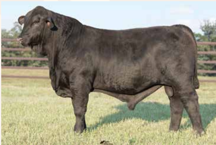
QVF BROADWAY 803H28 Son of Lot 269