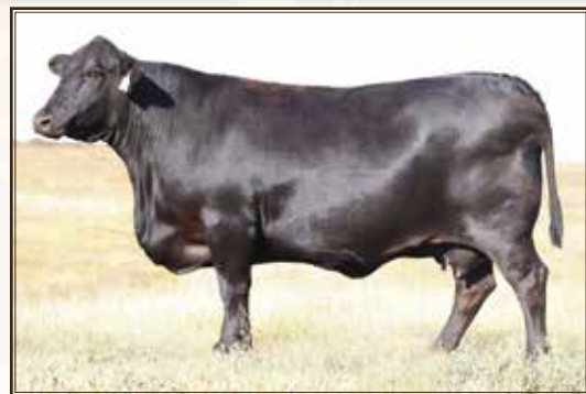
TTR A5051 U0286 X6200 Maternal granddam to Lot 1