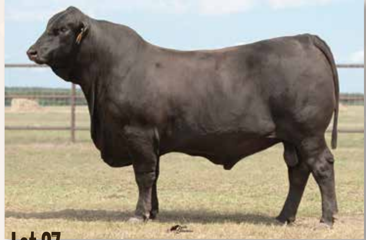
Lot 27 - SALACOA STRATEGY 23J22