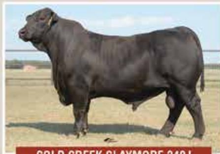
COLD CREEK CLAYMORE 240J BUSINESS LINE X GRANITE