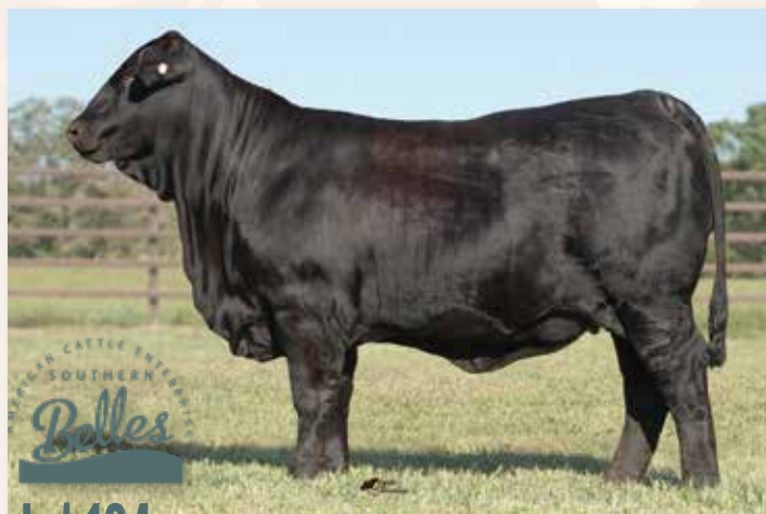
Lot 184 - ACE MS BROADWAY 99J52