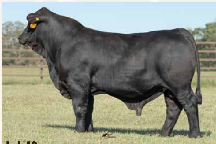
Lot 48 - ACE EMPOWER 535J50