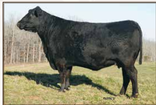
MB Ms New Direction 17R5 Dam of Lot 3