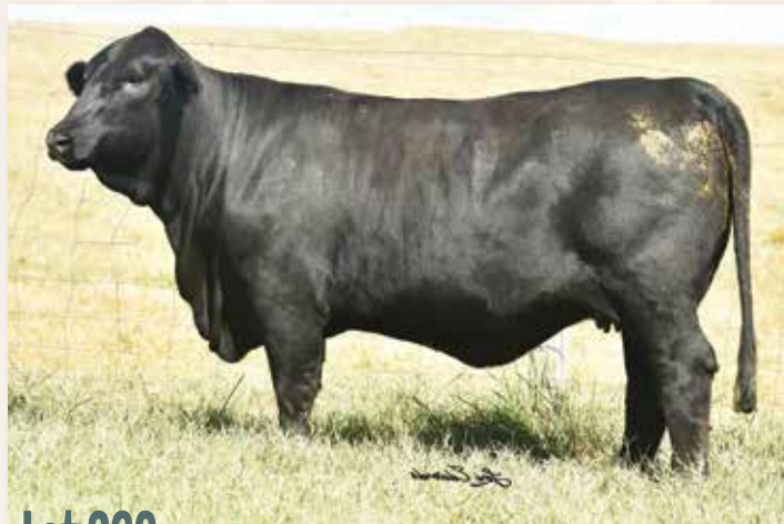
Lot 269 - MS SALACOA BIG CYPRESS 803D6