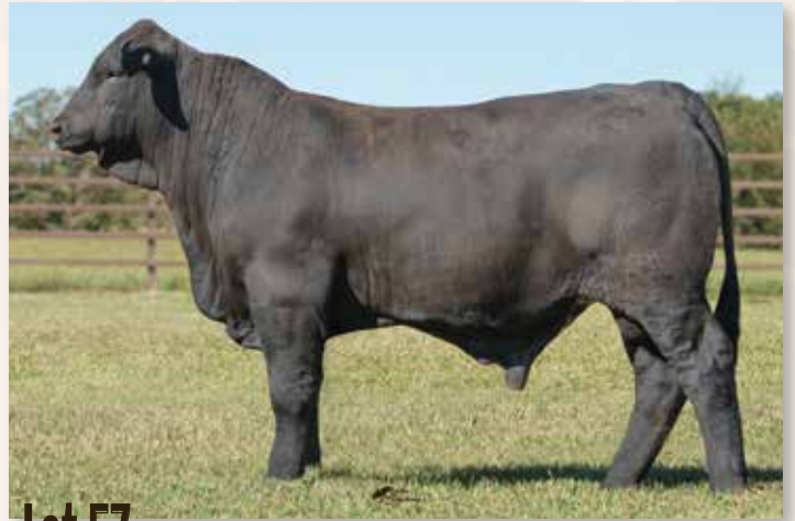
Lot 57 - QVF BY DESIGN 392J14