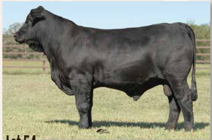
Lot 54 - ACE RELAX 192J63