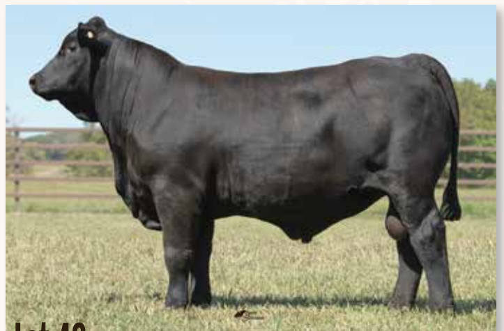
Lot 46 - ACE BIG LAKE 23J78