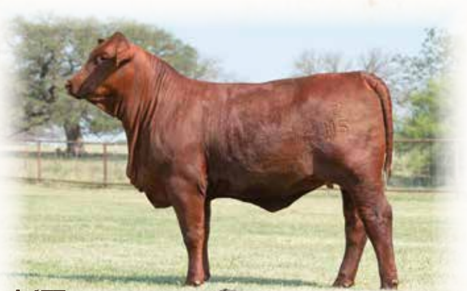
Lot 177 - MS HARRIS NITRO 2H5

2H5 is one of the first Nitro 46/18 daughters to sale. She is truly Strait breeding all the way. Her dam Liv is a Yancey favorite being sired by Mason and out of SR 837 who was one of the best cows ever owned by Strait Ranches. 2H5 scanned a 5.94%IMF. She post 12 EPD and Indexes in the top 30%.