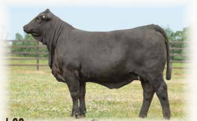
Lot 63 - SA/CJC MS BROADWAY 487H

Sired by the $67,500 Broadway and out of an exciting UB2 from the heart of the Vanna Farms program, 487H combines extreme power and mass with refinement and femininity along with a puppy dog disposition. She has an elite EPD profile with TEN traits in the top 20% of the breed, highlighted by a top 4% WW and a top 5% YW. Her young dam by Overload was the selection of Sunshine Acres and East Ridge Cattle in the inaugural Quail Valley Farms Female Sale in 2019. They thought so highly of her that she was flushed as a virgin heifer and that flush resulted in four outstanding heifer calves. 487H was undoubtedly the best calf, the best at weaning, and the best at yearling. Here's your chance to add an exciting donor prospect to your herd!! SAFE IN CALF