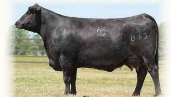
Lot 37 - BWCC MS HARVESTOR 889B40

889B40 incredibly ranks in the top 2% for 9 EPD traits. Donor potential in a lot of matings.