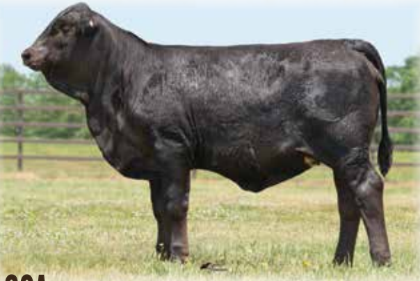
Lot 30A - ACE MS BIG TOWN 541J60