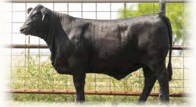
Lot 69 - TJR MS CROSSFIT 889/H2

If you need power in a moderate and appealing package look no further. This is a really good young Cross Fit daughter that excels with top 1% WW, 2% SC, 5% YW, 10% IMF and Term, 15% HP and 20% REA. We really wanted to bring quality and exciting lots and we believe she fits. She also sells safe to MC Sho Time 313H30, one of the most talked about bulls in the breed. He is complete in his design and structure and complete in his EPD profile. This is truly a lot to consider.