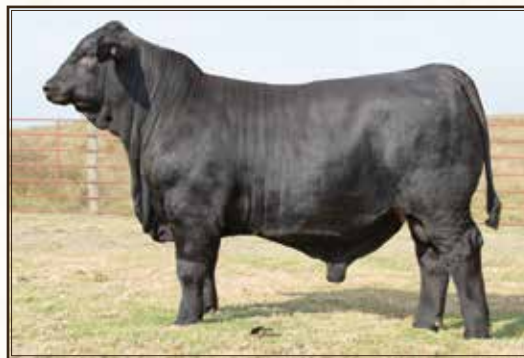
Conqueror of Salacoa 541H42 Son of Lot 73