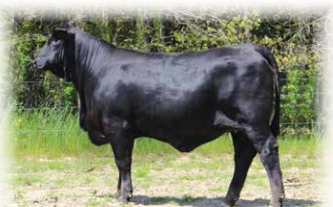
Lot 57 - DS MS HOLLYWOOD 107J3

Her full brother brought $7,000 at 2021 SVF bull sale. Her dam 107C2 is a rare Something Special daughter who is one of our best cows. She has a 386 day calving interval after 6 calves of which 5 were AI sired.