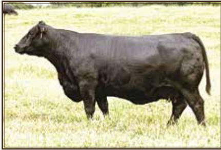
VF Ms Chill Factor 000D3