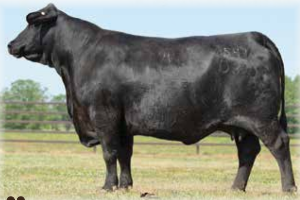
Lot 29 - OAKS MS CSONKA 541D36

541D36 is a powerful Nuff Said 541Y18 grand daughter. Her Never Surrender heifer calf on her side tells the story!!