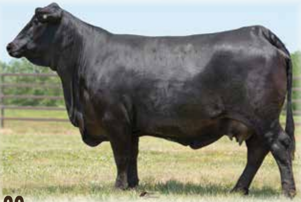
Lot 30 - MS SALACOA BOULDER 541D6

541D6 was a planned breeding between Ms. Salacoa Valley 541Z4 who is currently owned by Villa Ranch after they purchased her in Houston for $24,000. Z4 is an own daughter of 541M40 who was one the top producing cows in Brinks history. 541D6 is also a full sister to lot 75 that sales in the Elite sale. Her sons have averaged $6340 after 6 sold at Salacoa.