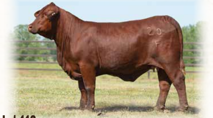
Lot 113 - QVF MS PISTOLERO 20F

A really fancy Pistolero female out of Candy that is currently owned by HL Farms. Her bull calf is currently on test and is look great. We think 20F can produce show cattle for sure. It is in her blood.