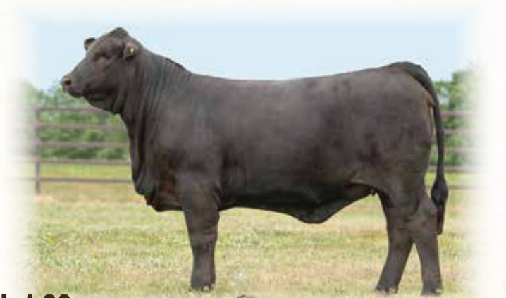
Lot 89 - QVF MS BY DESIGN 589J

QVF MS BY DESIGN 589J has the perfect phenotype of a moderation, depth and volume. She is simply an incredible ELITE Brangus. She has balanced EPD's that can be crossed with any Brangus herd sire. Being by the exciting By Design of Salacoa 406F10 makes her a bit of an outcross for a lot of programs. Her dam L&W MS NEW VISION 589D is a picture perfect Brangus female that goes back to Nuff Said 889T50 himself. 589J has never been exposed. She is ready for collection, AI or your herd sire immediately.