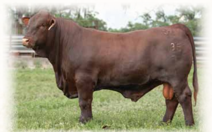
Service sire to Lots 153, 154, 155 & 156 - SR PARADIGM 135/7

A power Navidad 8/5 daughter our the legendary $350,000 revenue generating donor Silva 915/3 currently owned by Corppron Acres and Pinnacle Cattle Company. She ranks in the top 30% for 10 EPD traits and indexes including BW, YW, and REA. She sells with her stellar Marksman heifer calf at side.