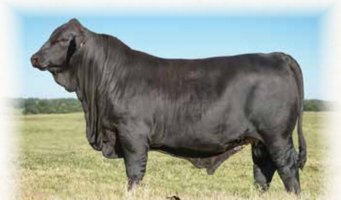
OAKS COMPLETE 541D27