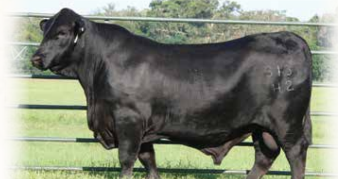
BWCC FINAL TIME 313H2