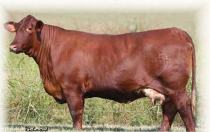
Dam of Lot 129 - MISS GRANDVIEW 555

A nice Clancy daughter out of the full sister to CVF 2022 Miss Grandview 555.