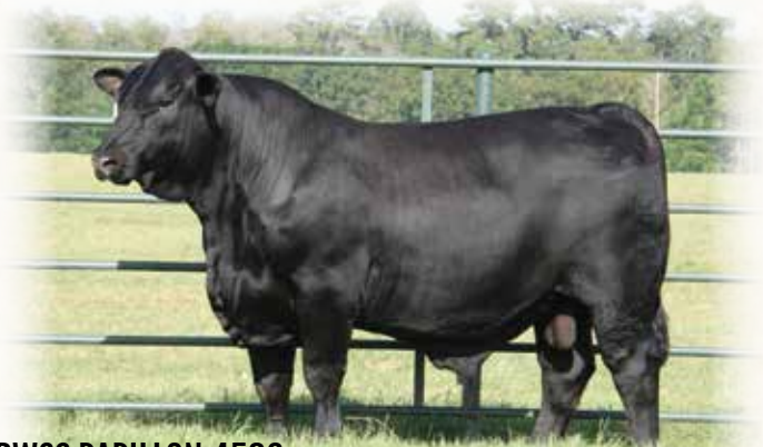
BWCC PAPILLON 458G