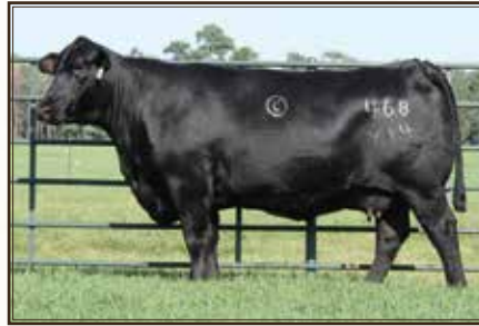
BWCC Ms Rock Star 468Y14