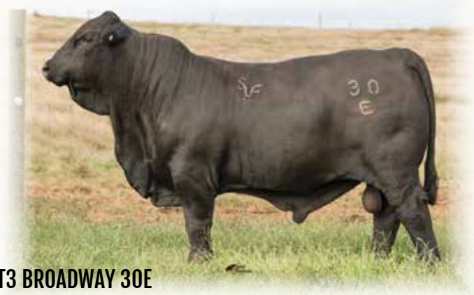
T3 BROADWAY 30E