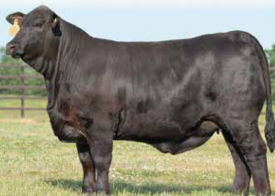
Lot 42 - MS SALACOA BIG TOWN 30J15

The last time a "30" cow family female of this quality sold from the SVF herd it was the start of a $1 million dollar revenue sequence between many progressive breeders that has produced some the most amazing breed changing Brangus. This includes the T3 MS 30Dn now owned by Herndon Farms, that her and her direct progeny have generated over $1,000,000 in revenue over the past 4 years. Not only is there similarity between these two with the 30 cow family, 30J15 is out of an Atlanta daughter just like 30D herself. It is rare one like 30J15 come up for auction this young. Don't miss the opportunity. ACE IS RETAINING THE RIGHT TO ONE IVF COLLECTION RESULTING IN AT LEAST 6 VIABLE EMBRYOS.