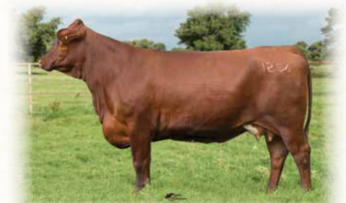
Dam of Lot 125 - HARCO 1256

An own daughter of Hatchet an out of HARCO 1256. Phenotype is all there. If you want to raise a show animal this is your cow. Bred to Marksman should work very nice.