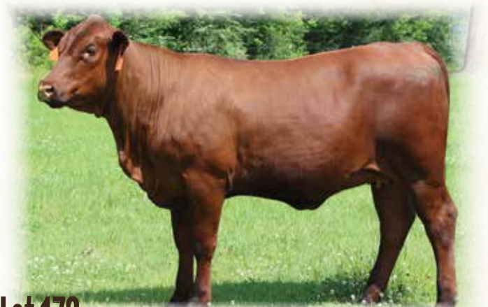
Lot 172 - TIDELAND 101

Choice or times two on these heifers that were picked from our keepers. TL 101 post 5 traits in the top 20%. She is a daughter of Matt's Hat 16/5 that we purchased from Harris Riverbend. He has done a great job for us in producing keeper heifers.