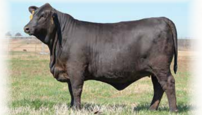
Lot 79 - MS BC MAJESTIK BEACON 535J2

Cross N 415H12 is out of a don't miss daughter of 415R23, MS Pass Port 415C10 that's headed to the donor pen this Fall. She brings the best calf to the weaning pen every time, every year! 415H12 had a 126% IMF ratio. Her sire Trinity 919E2 progeny have averaged over $8,000 in past sales including Ms. Trinity 535H that sold in last year's Elite sale to Cold Creek & Fenco Farms for $13,500. 415H12 is 3 months bred to Direct Line 30G5 who was the $27,000 high selling Business Line son from Suhn Cattle Company's 2020 bull sale.