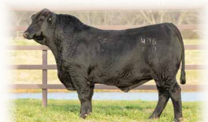
BY DESIGN OF SALACOA 406F10