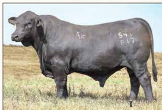
Game Plan of Salacoa 541F17 Son of Lot 73