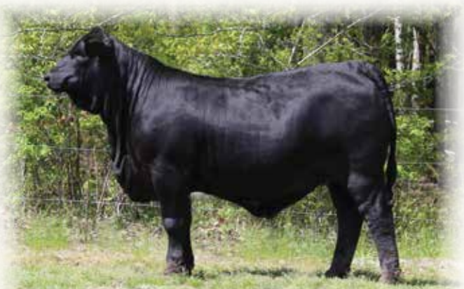
Lot 56 - DS MS EMPIRE 198J