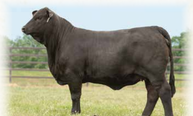
Lot 88 - QVF MS NEVER SURRENDER 535J6

QVF MS Never Surrender 535J6 post 10 EPD and Indexes in the top 25% including a top 1% REA. TAKE A LOOK AT HER REA EPD of 1.02 is trait leader for a cow. She had an adjusted %IMF score of 5.20 as well. 535J6 is a very powerful young heifer donor prospect. We think with her power and muscle she is set to make herd sires. 535J6 has never been exposed. She is ready for collection, AI or your herd sire immediately.