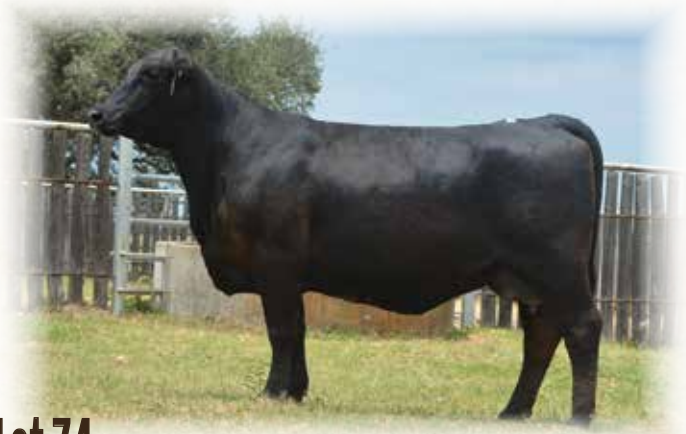
Lot 74 - BRIGGS MS STRATEGY 535F2

Briggs MS Strategy 535F2 was selected out of our herd as an "Elite" female. She starts with a 350 day AI calving interval after 3 calves. Her son sold this past Fall in our bull sale for $5,400. Phenotype is picture perfect. She ranks in the top 30% for 10 EPD traits and indexes including top 10% IMF and top 25% REA.