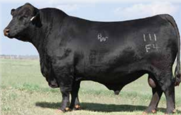
Son of Lot 9 - BWCC BIG LAKE 111F4

BWCC MS Rock Solid 11C6 is the dam of AI sire BWCC Big Lake 111F4. She projects a set of EPD's and inexas that are second to none ranking in the top 25% for 14. She has 15 calves in the registry and still going.