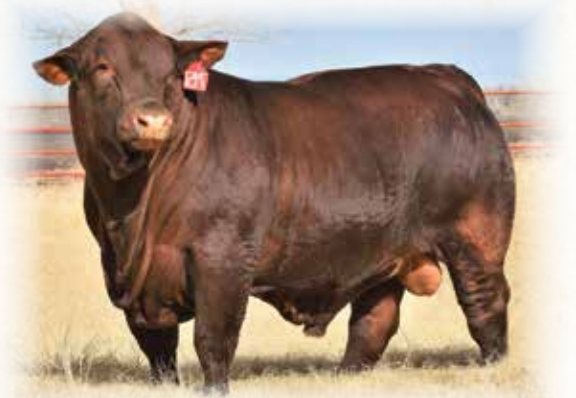
Sire of Lot 108A, 109A, 111A - RED DOC NEVER BETTER ET 7457