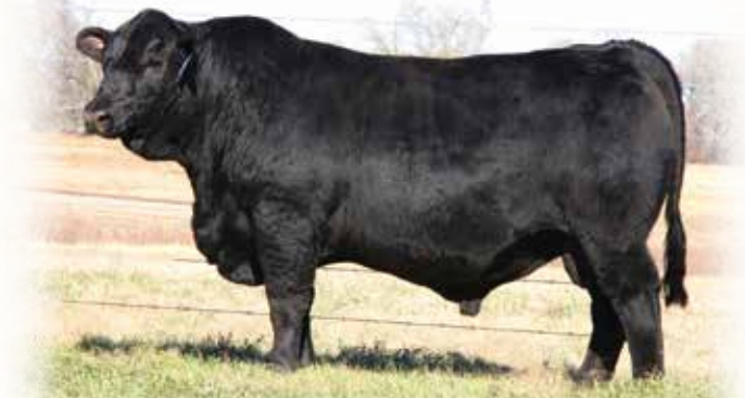
MC BLUE BLOOD 129H18