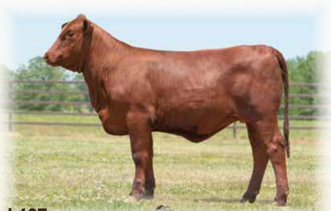
Lot 187 - MISS GRANDVIEW 7108J

7108J is an ET daughter of CB Nitro 46/18 out of our power donor 7108; a Hatchet 150 and 2S8100 bred female. She is level and long with a great front end. She post 6 traits in the top 15% including top 5% REA and top 4% Marbling. Ultrasound data will be available sale day. Sells Open.