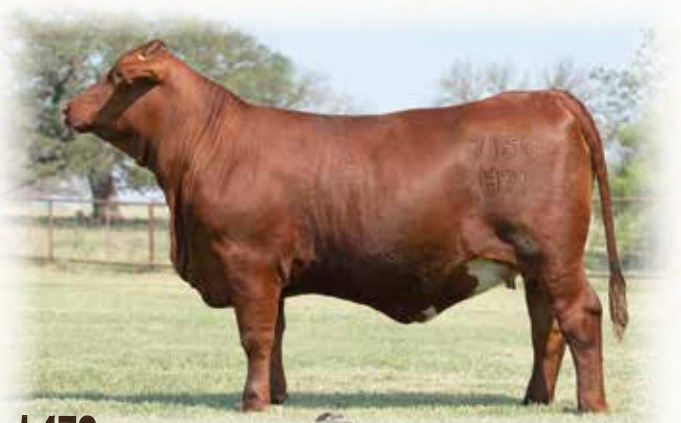
Lot 176 - MS HARRIS PARADIGM 7150H71

7150H71 is a very exciting female. She is one of the first Paradigm daughters born and is out of the donor Red Doc 7150. Her fertility EPD's are second to none. She ranks in the top 15% for Heifer Preg and Breed Back. She ranks in the top 3% for Marb. Red Doc 7150 is currently owned by Tideland. She has produced lead off bulls in bull sales and has more on the way. We think 7150H71 has the potential to follow in her mother's foot steps.