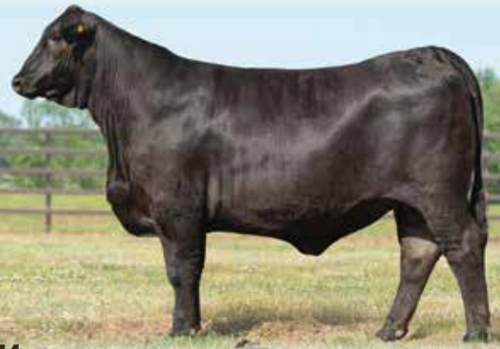
Lot 51 - MS SALACOA BIG TOWN 209H68

MS Salacoa Big Town 209H68 might be the most interesting breeding peace in the entire offering. Her EPD profile is balanced in every trait meaning she can compliment just about any herd sire. 209H68 is a result of the use of the best Angus genetics in the business to cross with breed leading Brangus. Her dam was purchased by Phillips Ranch and Southern Cattle Company in last year's SVF female sale. Her maternal siblings have already generated over $75,000 revenue for Salacoa Valley, T3 Ranch and ACE. Great opportunity in injecting new genetics into the Brangus breed. ACE IS RETAINING THE RIGHT TO ONE IVF COLLECTION RESULTING IN AT LEAST 6 VIABLE EMBRYOS