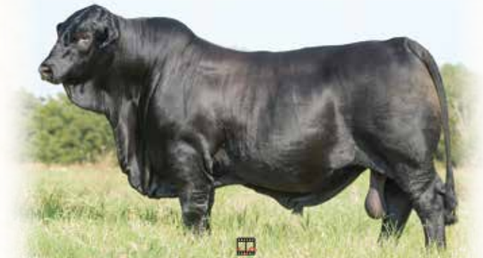
NEVER SURRENDER OF SALACOA 803D9