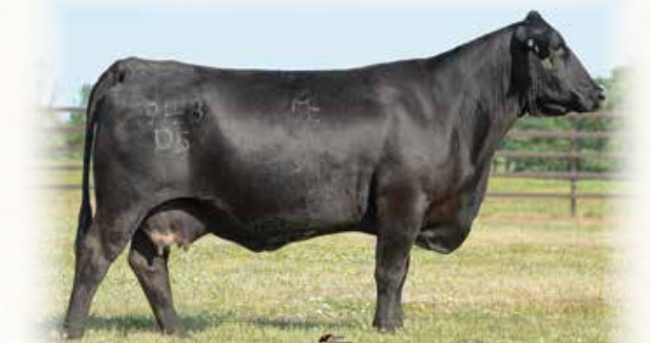
Lot 2 - MC MS CHILL FACTOR 948D5

MC MS Chill Factor 948D5 is truly one of the great EPD profile donors in the breed. With that said, not only does her numbers read well, they produce like they read. Tremendous CED, BW to YW spread, carrying perfect Milk of top 35%, as well a top 10% REA and a huge top 1% IMF. She will add to any bull's numbers out there. Recently her "Tanks Alot" progeny rang the bell at the 22' Mound Creek bull & female sale.