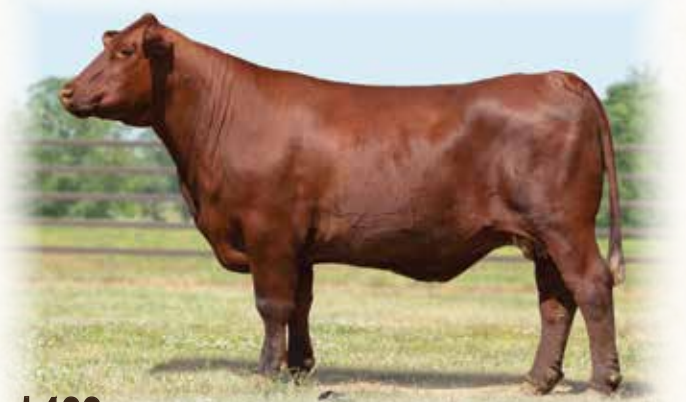
Lot 122 - WENDT 1230

Another one of our Wendt females. She has a 397 day calving interval after 3 calves. Sales her Never Better heifer calf at side.