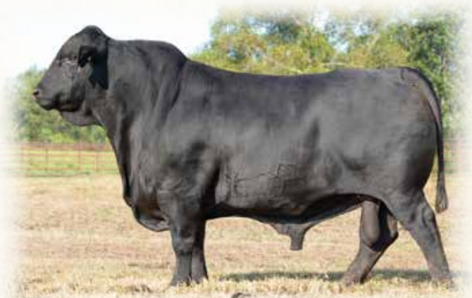
Maternal grandsire of Lot 54 TINSELTOWN OF SALACOA 468D4

MS Salacoa Rock Steady 209J12 is a partnership with T3 Ranch. She has a multi-million dollar pedigree listing Boulder, 209L11, 541M40, 541Z4, 468P22, Stonewall, 209B6. Great set of EPD's to mate to just about any herd sire.