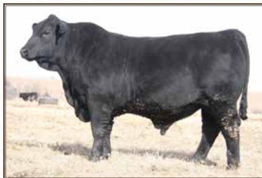
Suhn's Direct Line 30G5 Service sire to Lots 81 & 82