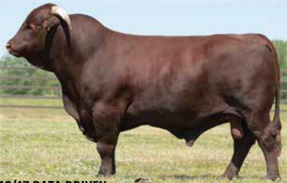
KR143/17 DATA DRIVEN