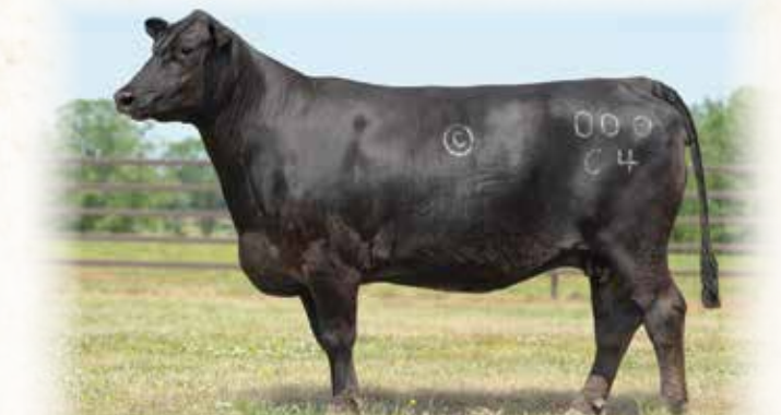
Lot 4 - BWCC MS INTERNATIONAL 000C4

BWCC MS International 000C4 is the dam of the $150,000 BWCC Blackwather 000H9. She brings a stellar EPD profile to the table with perfect growth, milk, and carcass blend and pegs the breed indexes across the board.