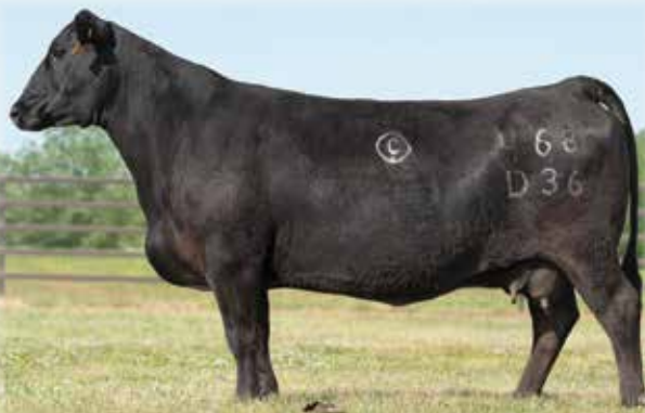
Lot 10 - BWCC MS REWARD 468D36

BWCC MS Reward 468D36 is a donor we started working ourselves. We have high hopes for her calves as sale toppers. Get in and own her before she becomes famous.