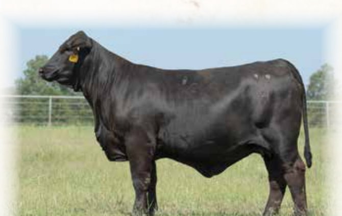
Lot 78 - MS BC 9U8E4 99H

Selling Full Possession & 1/2 Embryo Interest MS BC 9U8E4 99H was hand picked from our herd as an ELITE Brangus female. We have spent a lot time and money buying, breeding and raising the best Brangus cattle in the business. We truly think this young exciting donor is going to be a big part of turning to the next chapter for Bushly Creek. We will 100% guarantee to the buyer our dedication to produce the kind of progeny from 99H that will build a program and be public popular. 99H has an incredible EPD and Index profile. She ranks in the top 35% for 12 EPD's and Indexes. That is very ELITE! 99H can be bred to any bull and the breed and add value both in genotype and phenotype. 99H is palpated safe in calf.