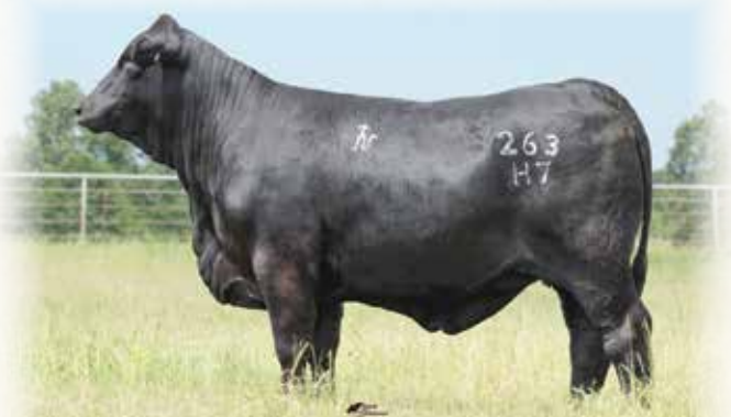
Lot 82 - CN MS TRINITY 263H7

CN MS Trinity 263H7 had a 118% IMF ratio. She is a Trinity 919E2 daughter and out of a flush mate to 263E5 that Quail Valley purchased in the 2019 Genetic Edge sale. 263E5 sold two $10,000 heifers in last year's Elite sale. 263H7 sales 5 months bred to Direct Line 30G5 who was the $27,000 high selling Business Line son from Suhn Cattle Company's 2020 bull sale.