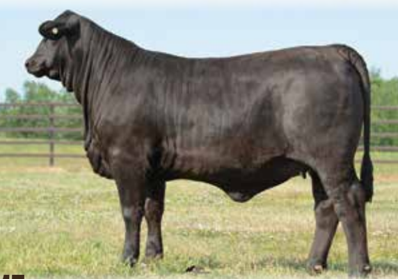
Lot 47 - MS SALACOA BIG TOWN 535J35

PE to DMR Kingdom 535G45 (10434685) 3/1/22-4/15/22, By Design of Salacoa 406F10 (10396325) 4/27/22-6/10/22. MS Salacoa Big Town 535J35 is out of a great Brazil daughter 535Z10. 535J35 post 11 EPD and Indexes in the top 35% including a top 3% Milk and REA. ACE IS RETAINING THE RIGHT TO ONE IVF COLLECTION RESULTING IN AT LEAST 6 VIABLE EMBRYOS.