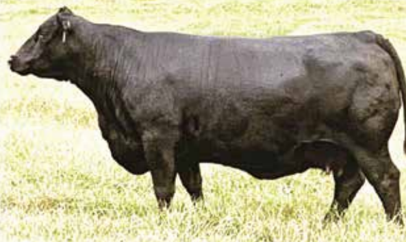
Dam of Lot 75C - VF MS CHILL FACTOR 000D3

VF MS Empower 000J28 is out of our donor VF MS CHILLFACTOR 000D3 that we consider to be the best OOOS50 offspring and the best donor that Vanna Farms has raised . OOOS50 lineage is the best in the breed . An own daughter of 000D3, MS VF MS Game Changer 000B4 produced the high selling female at the 2022 TBBA sale this spring . 000J28's sire QVF ENPOWER 30G16 is one of the upcoming young herd sires in the breed that is out of the famed 30D family donor cow. 000J28 sales reporting 3 traits top 1%, 5 traits in the top 4 % and 10 traits in the top 15%.