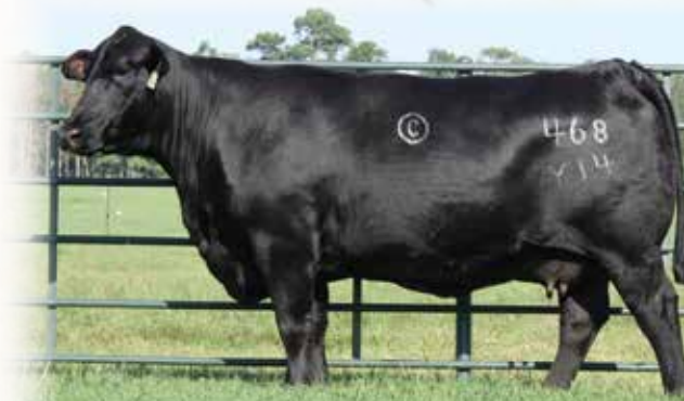
Dam of Lot 75B - BWCC MS ROCK STAR 468Y14

VF MS Blacktop 468J76's dam BWCC ROCK STAR 468Y14 needs little introduction and is arguably the best Rockstar daughter and one BWCC best donors of all time. She was the high selling female of the BWCC spring dispersal for good reason. She has over 8 herd sires being used in Brangus herds in the country . 468J6 is sired by the BWCC BLACKTOP 192G22. BlackTop is the $35,000 young herd sire that is doing such great things in the Vanna Farm's and Whitley herds. The 000F16 pair that recently sold to the Rice family in April had a BlackTop heifer on her side that pushed to make the $26,000 sale topper. 468J76 writes 5 traits in the top 10 % and 9 traits top 15 %