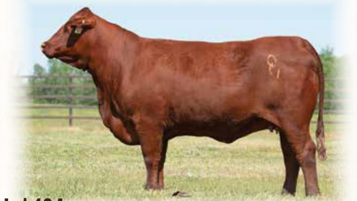
Lot 124 - QVF MS 1167 539F

Nice young cow with her entire life in front of her. Negative BW and top 20% SC sets up nice being bred to Marksman.