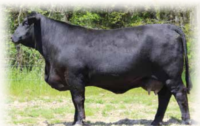
Lot 55 - DS MS HOLLYWOOD 107G2

DS MS Hollywood 107G2 is one of very best young cows. We wanted to bring our very best to this "Elite" sale. She has a 390 day calving interval conceiving to AI breeding both times. We think her Empower heifer calf is very special as well. 107G2 would be a donor for us if we wouldn't have wanted to try to showcase our program.