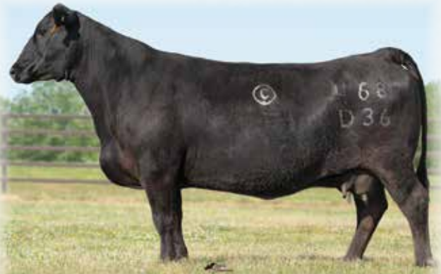
Full sister to Lots 24 & 25 - BWCC MS REWARD 468D36

468C44 records a staggering 7 EPD traits in the top 10% including a top 1% Heifer Preg and top 3% Fert Index. Fertile cattle are the key to economic success!