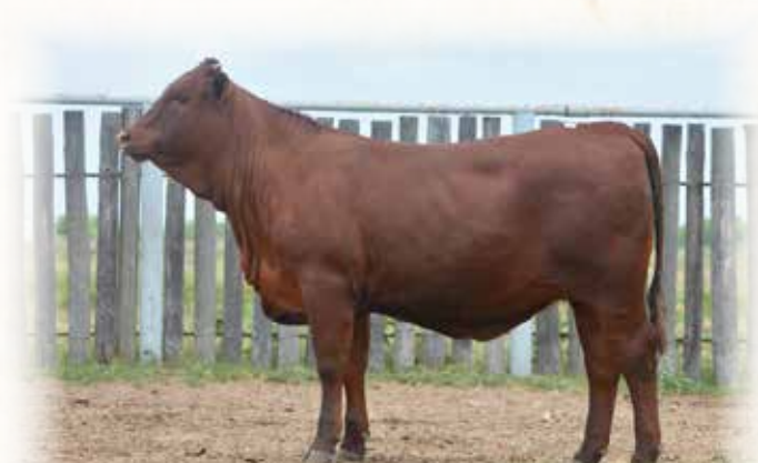
Lot 179 - BRIGGS CHOSEN ONE 1524J

Briggs 1524J is one of the features of this year's Elite Santa Gertrudis offering. She is an own daughter of Harris 1524 who is the lead off donor in the Mature Cow sale. 1524 is the dam of trait leader Harris 190E. 1524 is one of those 1% cows that never misses. 1524J is by the SGBI Herd Sire of Year KR651/18 Chosen One who also sales in this sale. 1524J ratio 113% for IMF and 107% for REA. She post 13 traits in the top 30% of EPDs and Indexes including a top 1% for Milk her the highest ranking in the entire offering. If you needing to add milk in your herd like most then here is your donor.