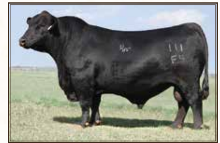
BWCC Big Lake 111F4