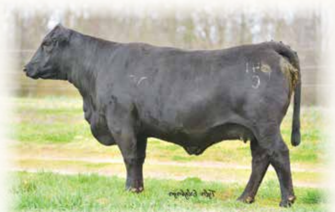
Dam of Lot 77 - VF MS RESET 541C7

541H4's donor dam VF MS Reset 541C7 has done great things in the VF heard and was Star G pick in last year's Elite sale for $12,500 . . She is sired by one of the hottest young herd sires in the breed BWCC Big Lake 111F4. She post 4 EPD traits top 3% and 6 in the top 10%..