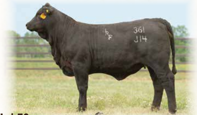
Lot 59 - HRF MS BEACON-F5 361J14

361J14 is out of a Excellent Beacon son we kept for in herd use. She's fancy and gentle. She packs quite a punch in the power department with Top 10 WW and Top 10 YW EPD Rankings. She has a no holes pedigree packed full of donors and a Ai Sires. Lots of mating choices with this one!