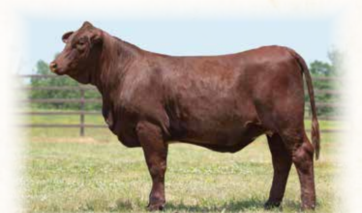
Lot 162 - MISS GRANDVIEW J038

J038 is a Gunsmoke 253E daughter out of a NC Sledge 789 female. She's maternally line bred NC Hatchet 150 and proves 7 traits in the top 30% of our breed. Ultrasound data available sale day. Sells open.