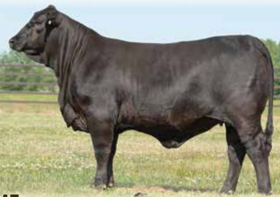
Lot 45 - MS SALACOA ATLANTA 541J32

PE to By Design of Salacoa 406F10 (10396325) 4/27/22-6/10/22. MS Salacoa Atlanta 541J32 is an Atlanta daughter out of MS Salacoa Patton 541Z that sold to Villa Ranch for $24,000 in the Houston sale. 541Z is an own daughter of 541M who was one of the best donors in Brinks cow herd history. 541J32's pedigree and performance lines her up to become a great donor in modern day. ACE IS RETAINING THE RIGHT TO ONE IVF COLLECTION RESULTING IN AT LEAST 6 VIABLE EMBRYOS.