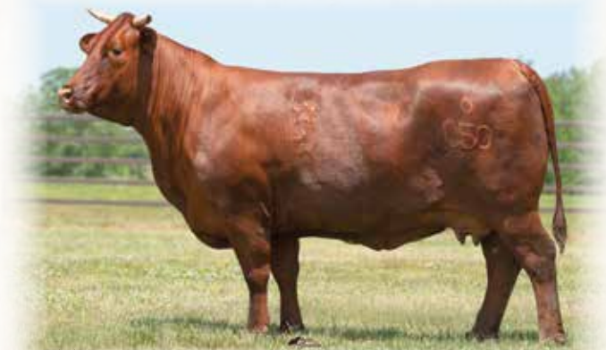
Lot 116 - RED DOC 6050

A nice cow that has a 394 day calving interval after 4 calves. Can't judge a book by its cover. 6050 brings one of the stoutest calves in to the pen every year.