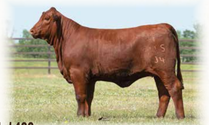
Lot 166 - TF 0115J4 ET