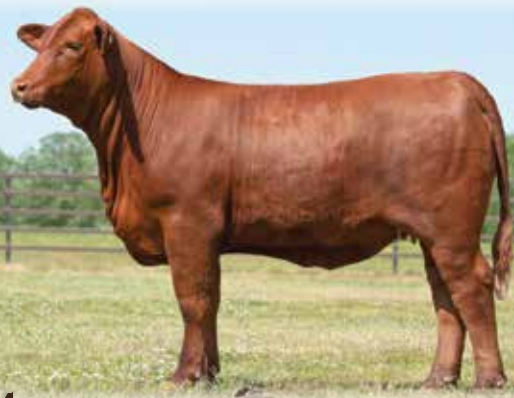
Lot 181 - SVF MS GENESIS 23J59

This is a tremendous 3/4 SG x 1/4 Brangus female. She is by SR Genesis 75/3 and out of SVF Vegas 23D56 who is Lot 139 in the mature cow sale. A perfect phenotype and 10 EPD traits in the top 30%. New genetics for the breed!