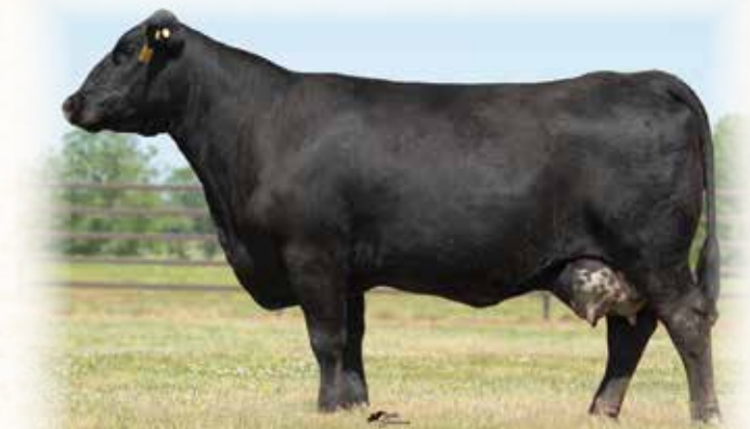
Lot 39 - BWCC MS REWARD 980C5