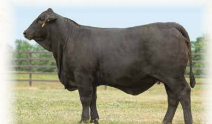
Lot 61 - CJB 21J

AI'd 5/11/22 to BWCC Big Town 192B16 (10266676). CJB 21J is one of two exciting Filal Cut 924X daughter. Final Cut daughters are getting hard to find especially this young due to the limitation to semen. Big body and big top is the best to way to describe this 21J. She ranks in the top 30% for 11 EPD and indexes. Her Guardian dam 21C has a calving interval of 395 days after 7 calves of which were all 100% AI bred.