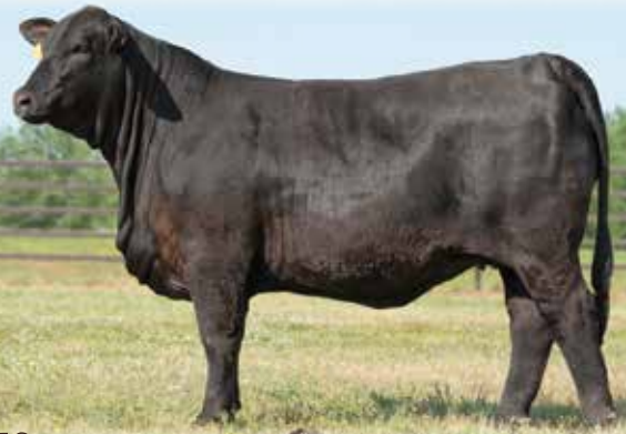
Lot 52 - MS SALACOA 535F9 BT 468H55

MS Salacoa 468H55 is a tremendous donor prospect in both phenotype and genotype. Take a look at her negative BW, high Milk, moderate cow weight, fertility, and above average carcass. She is definitely a prospect donor. ACE IS RETAINING THE RIGHT TO ONE IVF COLLECTION RESULTING IN AT LEAST 6 VIABLE EMBRYOS.