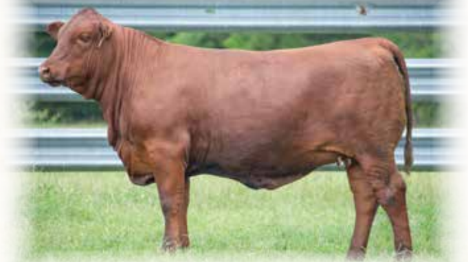
Lot 175 - SR MS NITRO ET 745/J2

SR Ms. Nitro ET 745/J2 is an ET daughter of our high selling Nitro 46/18 bull (now owned by Harris Farms) and out of the Briggs 745/14 donor cow that we purchased through the Houston International Super Sale. 745/J2 currently has 8 EPDs ranking in the Top 15% along with all three indices ranking in the Top 10% or better. She had an actual carcass ultrasound scan (4/9/2022) of 6.38 %IMF and 1.18 REA/cwt. 745/J2 was exposed via AI to Harris Guns Up 216/5 (20152716), an own son of the great Hinnant-Fulbright 9/153 donor, on 4/18/22. Breeding status and additional exposure updates to be provided at sale.