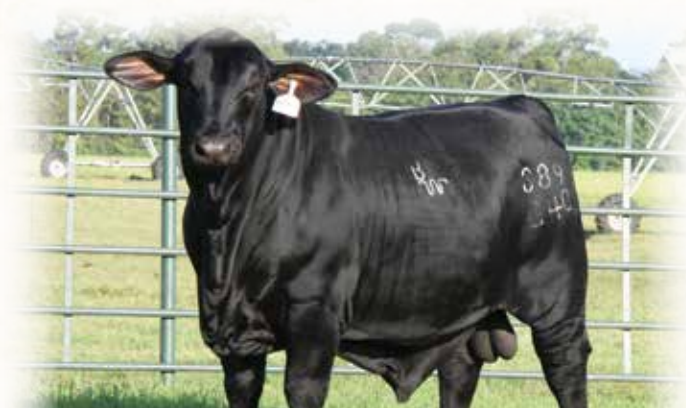
BWCC BURLY 889G40