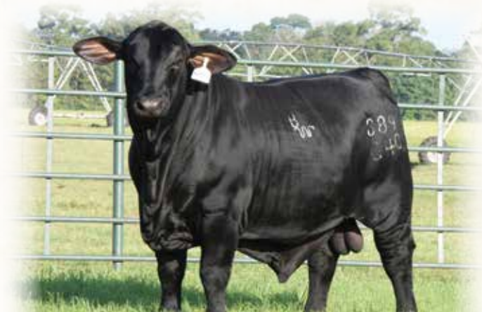
Sire of Lot 92 - BWCC BURLY 889G40

BWCC Ms. Massive 192D5 is one of the favorites in the donor pen at AV Brangus. She is a powerhouse being deep sided, big middle, perfect uddered all wrapped in a moderate frame. She carries an impressive EPD panel, top 1% for WW and YW, top 2% REA and HFR preg, and top 3% FERT. This is a cow we have worked to multiple sires, with great success, producing several grade 1 embryos from each mating, all while staying within her calving season. One of her daughters, 192J6 was a top seller in the Addison Brangus sale this past fall. The sire of the embryos, BWCC Burly 889G40, has been in high demand this spring after his first calves hit the ground. Burly is siring calves with added looseness, and overall Brangus eye appeal. The projected EPD's from this mating are off the charts! 8 traits in the top 10% of the breed, and 6 of those in the top 3%.