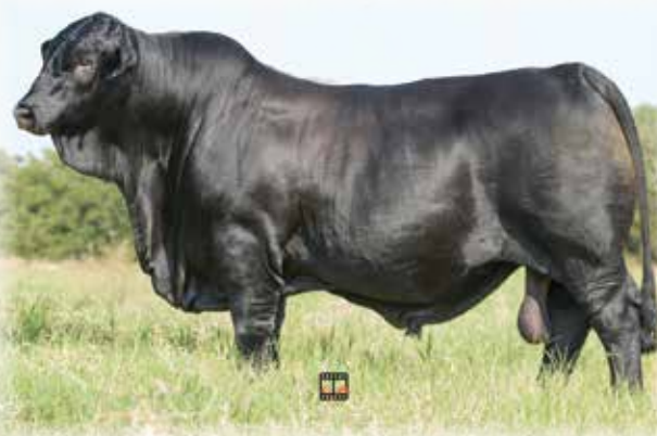
Service sire to Lots 9 & 10 NEVER SURRENDER OF SALACOA 803D9

Exciting young April bull calf by Mile Marker.