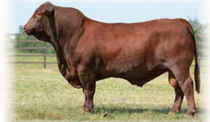
Service sire to Lots 181, 182, 183 & 184 KR CHOSEN ONE 651/18