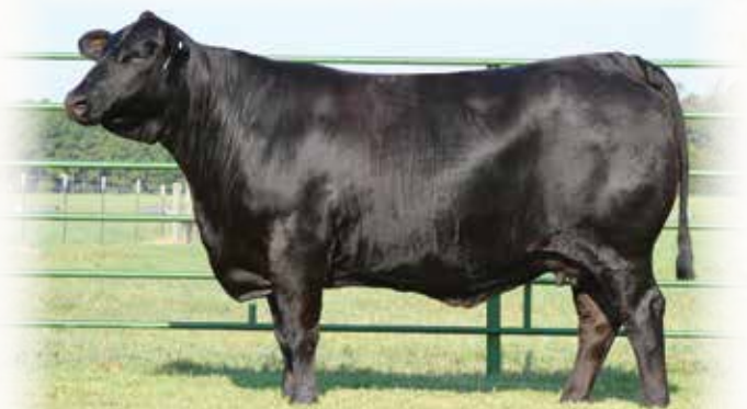
Great maternal granddam of Lots 64 & 65 MC MS QUIET LADY 000S50

000J3 writes 11 EPD and indexes in the top 30% including a top 10% Milk making her very much a donor candidate