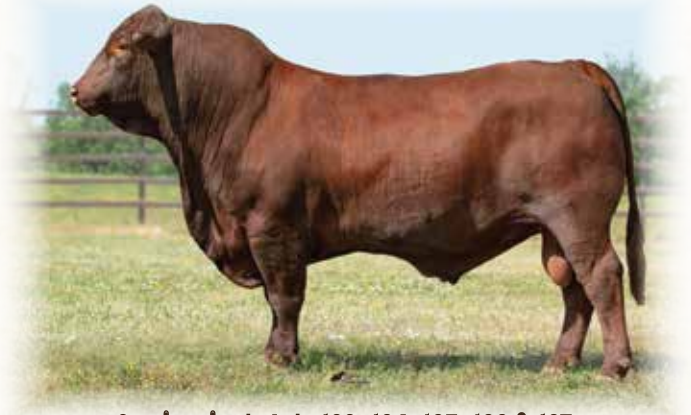
Service sire to Lots 163, 164, 165, 166 & 167 KR CHOSEN ONE 651/18