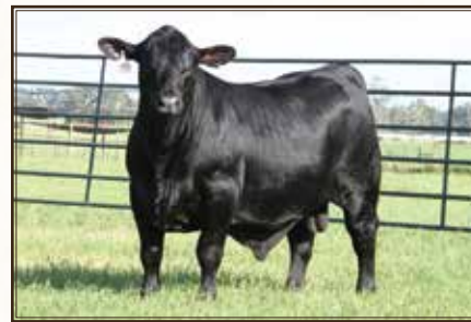
BWCC Black Top 192G22