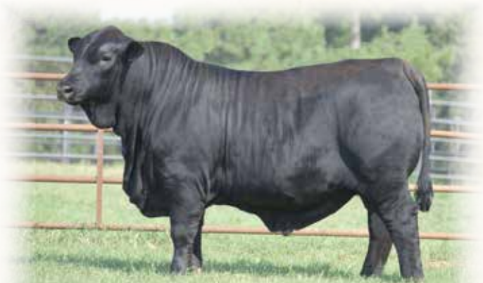
DMR KINGDOM 535G45