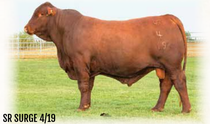
SR SURGE 4/19