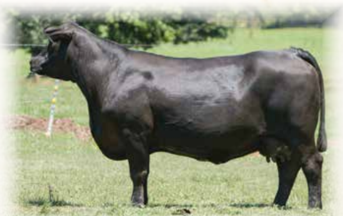
Dam of Lot 87 - CLVR MS NEW VISION 99A13

QVF MS Never Surrender 99H5 Grand dam is the legendary 101 MS Patton 99X9 that was the incredible donor from Clover Ranch. 99H5 post 11 EPD and Indexes in the top 25%. She scanned a whopping 5.39%IMF and a huge 12.14" REA. Being sired by Never Surrender and having such a powerful donor in her direct lineage 99H5 is set to make great Brangus. She has never been exposed. Ready for collection, AI or your herd sire.