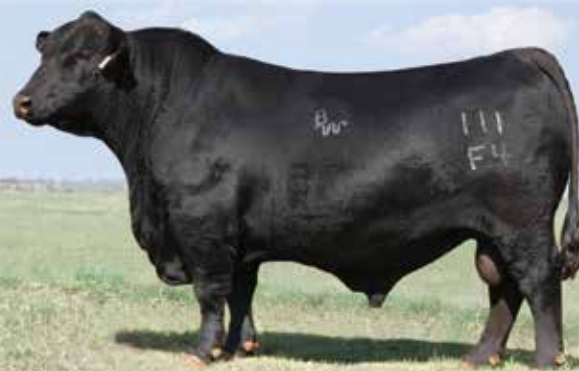
Sire of Lot 75A - BWCC BIG LAKE 111F4

VF MS Big Lake 468J58 is out of the hottest young donor in the breed. BWCC Overload 468D22 who has already produced herd sire BWCC Merger 468F9 and more herd sire prospects on the way this fall . Three eight month old daughters have averaged $19,000 this last year alone. 468D22 has a 21 MILK EPD ranking the top 1% and 6 traits in top 3% in the breed . Herself 468J58 reports 4 EPD traits in the top 1% and a top 35% Milk.