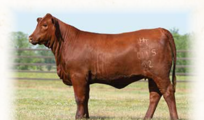
Lot 163 - TF 0115J2 ET

Here is a chance to own a set of full sisters that we bred to make cows that would make it in the pasture but carry the genetics of the breeds carcass leaders. Their sire TF 5369G4 is out of the trait leading carcass Queen RDF 5369 Tinney Farms and Quail Valley purchased in Houston for $32,000. 5369 is also the dam of Jackpot that is a popular syndicated herd sire and the #1 Marbling trait leader of young sires. The heifers dam Townsend 0115 is one of our top donors and really exemplifies what a Santa Gertrudis cow should look like with her long and deep body with an absolute perfect udder. These heifers all rank in above breed average for 12 EPDs and indexes including top 10% or better for Marbling. We would love to see these girls stay together but we are going to let you pick them. 0115J2 scanned 5.01%IMF REA/CWT 1.2