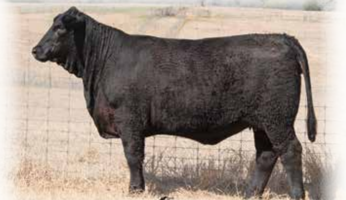
Lot 71 - PR MS BIG TOWN 201J

This heifer is packed with growth, fertility and carcass in a package that is pleasing to the eye and will be a crowd favorite sale day. She posts top 1% HP, 3% REA and Fert, 10% IMF and TM, 15% YW and 20% WW and Milk. She has the genetic profile to elevate your program and a look that will be well received.