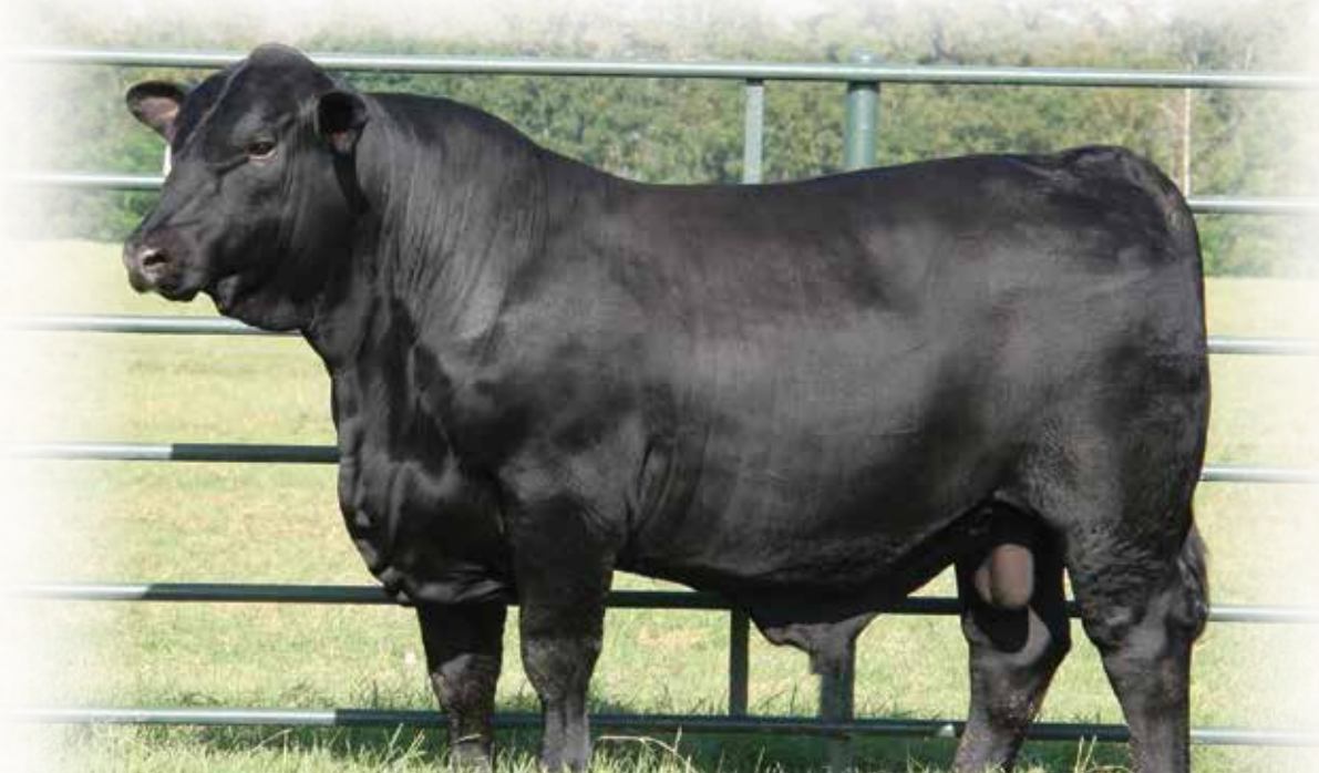
Lot 93 - BWCC PAPILLON 458G