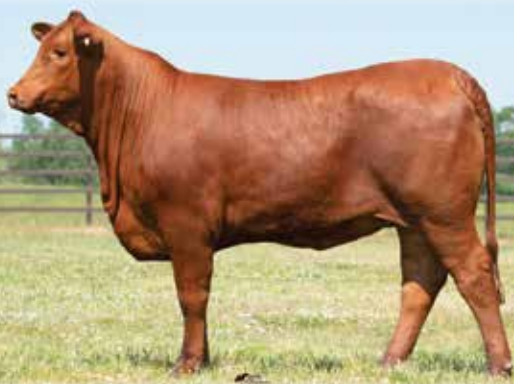
Lot 182 - TA MS GENESIS 26J13

3 ET full sisters out the Dos Bros 26/6 donor and by SR Genesis 75/3. All three of these heifers rank above breed average in an incredible 13 EPDs and Indexes. Their donor dam sales in the mature cow sale as Lot 137. All three sisters have been running with KR651/18 Chosen One for the past 40 days.