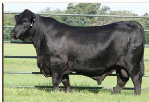
BWCC Final Time 313H2 Son of Lot 1

PE to BWCC Mile Marker 889E32 (10359796) 12/27/21-4/2/22, Never Surrender of Salacoa 803D9 (10318185) 4/27/22-6/8/22.