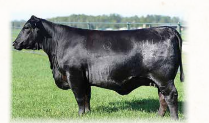
Dam of Lot 91 - BWCC MS ROCK SOLID 111B2

SB MS Crosscut 111J2 is a powerful female in her growth and muscle. She is so impressive in her length of body and balanced style. She post top 1% for 5 EPD and Indexes and 8 in the top 10% including SC, REA & IMF. Her donor dam 111B2 has 24 registered in the IBBA data base. She is full sister to current popular AI sire BWCC Big Lake 111F4's dam MS Rock Solid 111C6 that sales in the QVF mature cow sale.