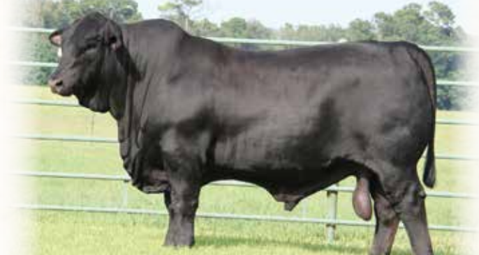
BWCC BIG TOWN 192B16