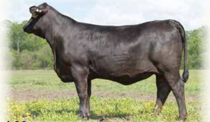
Lot 86 - T3 MS NEVER SURRENDER 406J12

T3 Ms. Never Surrender 406J12 is a ELITE female with a UNIQUE pedigree. She is an own daughter of Never Surrender 803D9 daughter and out of the $26,000 TTR A5051 donor that is currently owned Phillips Ranch. TTR A5051 is also the dam of herd sire By Design of Salacoa 406F10. She post powerful EPD's and Indexes writing 11 in the top 25% along with an above average Milk. If you want to mass produce bulls for the commercial industry 406J12 is the perfect Brangus female to have in your donor. AI'd 5/17/22 to CB Paramount 7139H2. T3 is reserving the right to one IVF collection resulting at least 6 viable embryos.