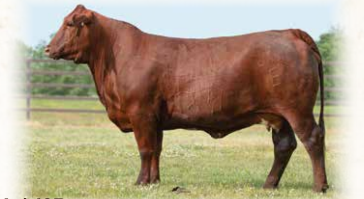
Lot 135 - BRIGGS 565E

Balanced cow ranking in the top 35% for 11 EPD traits including a top 5% REA and top 3% Marbling and top 10% HP and top 15% Breed Back. She has a 385 day calving interval after 2 calves.