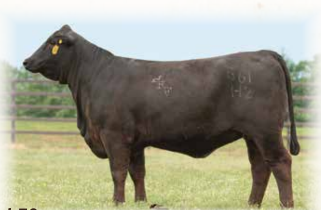
Lot 58 - HRF MS EPIC 561H2

Power Packed Epic daughter with a 5 star disposition. 561H2 is very long spine, moderate framed, with plenty of natural muscle. She sports 10 EPD rankings in the top 25% of the breed, including top 5% WW and top 10% YW.