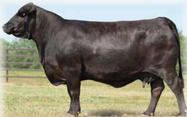
Lot 15 - MS SALACOA STONEWALL 209B6