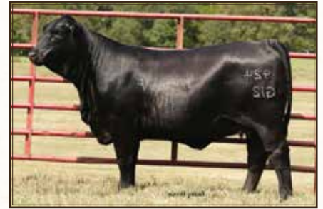
VF Ms Monument 924G12