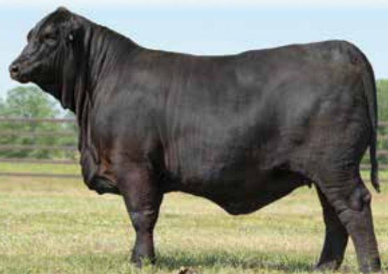
Lot 49 - MS SALACOA EMPIRE 23J21

MS Salacoe Empire 23J21 dam 23D5 has an incredible calving interval of 352 days after 5 calves that were all AI sired. 23J21 has an incredible maternal look and will be a front pasture cow. She post 10 EPD and indexes in the top 35%. ACE IS RETAINING THE RIGHT TO ONE IVF COLLECTION RESULTING IN AT LEAST 6 VIABLE EMBRYOS.