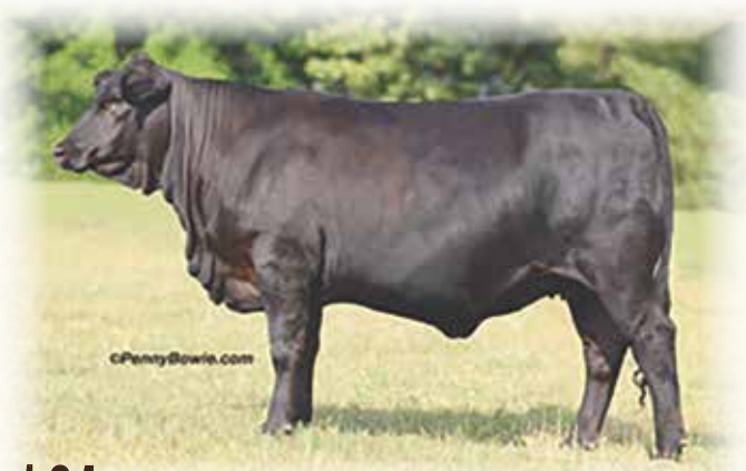
Lot 84 - COLD CREEK MS CSONKA 88H5

Royally bred from top to bottom, Cold Creek Ms. Csonka 88H5 has all the right pieces that a Brangus female needs to become the next big-time donor. She is a rare direct daughter of the immortal Csonka of Brinks 30R4. While she is moderate-framed, she is stamped with his long side, wide top, and plenty of bone. On her dam's side she goes back to one of our most productive and impactful donors, Cold Creek Ms. Largent 88X2. This unique and powerful heifer has it all. From every dimension 88H5 stands as one of the deepest-sided and thickest females we have created. Her excellent bone, tremendous volume, and yet great femininity and docility make her special indeed. Her impressive genetic profile boasts eight top 35% or greater breed EPD traits including 20%WW, 15%YW, 15% Heifer Preg, and 10% Term Index. You cannot go wrong with this heifer. In addition to her already great package, her AI to BWCC Burly 889G40 on 5/21/22 should produce an outstanding calf. Don't miss your opportunity to own what is sure to be a great one.