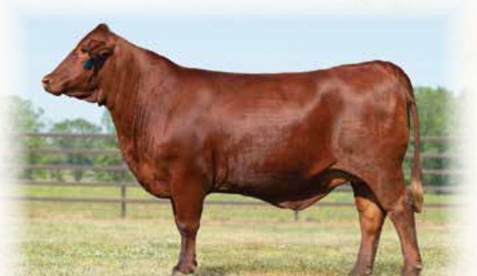
Lot 128 - HEFTE RANCH F54

Here is one of our Hefte ranch females we purchased. Her Paradigm bull calf is on test and we can't wait to see him finished.