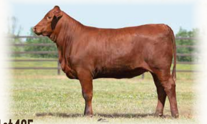
Lot 165 - TF 0115J10 ET