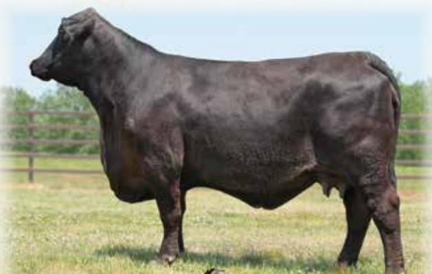
Lot 16 - MS SALACOA STRATEGY 209F16

This great Stonewall daughter is as consistent as it gets. She has 23 calves in the registry thus far. She is the best of the tremendous cross of Stonewall and 209L11.