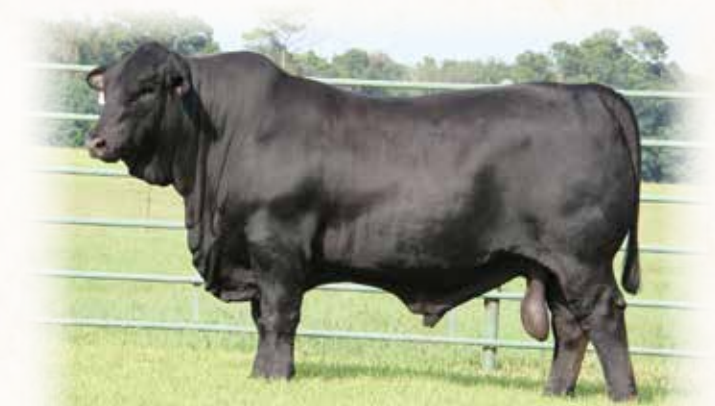
Son of Lot 3 - BWCC BIG TOWN 192B16

BWCC MS Revelation 192W8 is the dam of the top Brangus AI sire BWCC Big Town 192B16 who has generated life time earnings over $1,000,000 dolloars in revenue through his semen, sired progeny, and embryos. He has had 3 sons bring over $100,000 at auction. With that said, the great thing truely about Big Town sons is they will avegare rank the favorites in purchase price with commercial cattleman sale after sale. His daughters appear to be holding the impressive milk as well. Not often you will get to directly own a cow that has produced a bull like Big Town 192B16.