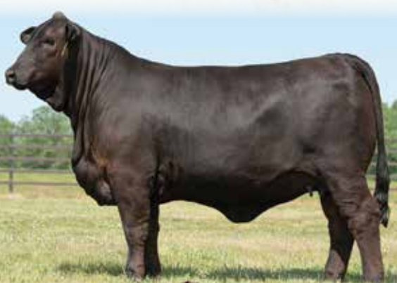
Lot 44 - MS SALACOA BIG TOWN 541J26

MS Salacoa Broadway 541J49 is out of the 541D6 donor that is selling as Lot 30 in the Mature Cow herd dispersal. 541D6 is out of the Brinks 541M40 who was one of the great donors ever in Brinks breed history. 541J49 ranks in the top 30% for 12 EPD traits. ACE IS RETAINING THE RIGHT TO ONE IVF COLLECTION RESULTING IN AT LEAST 6 VIABLE EMBRYOS.