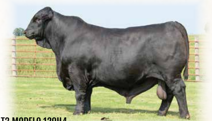
T3 MODELO 129H4