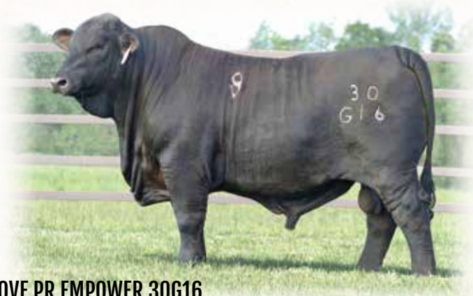
QVF PR EMPOWER 30G16