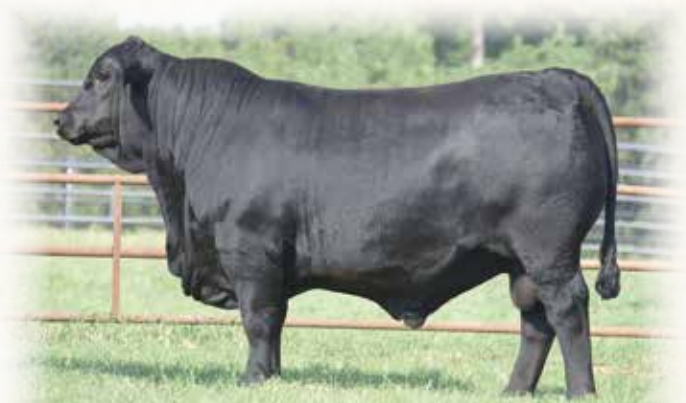
DMR ENTREPRENEUR 795G26