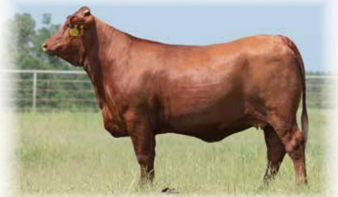
Lot 169 - WR 445H

An own daughter of RDF Checkmate 7069. Hand picked from our ELITE heifers we were saving. Ranks in the top 20% for Milk. She is bred to bulls we spent $70,000 to acquire. We think she is donor material.