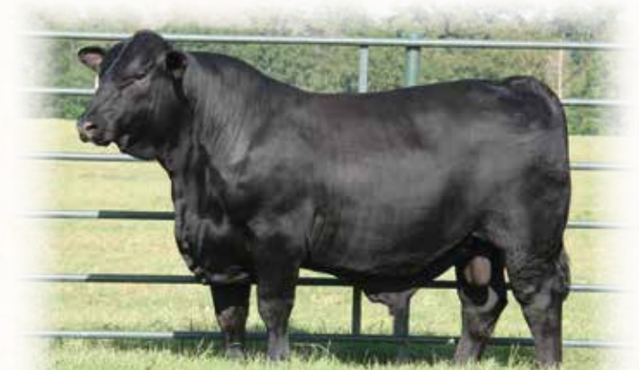
Son of Lot 5 - BWCC PAPILLON 458G