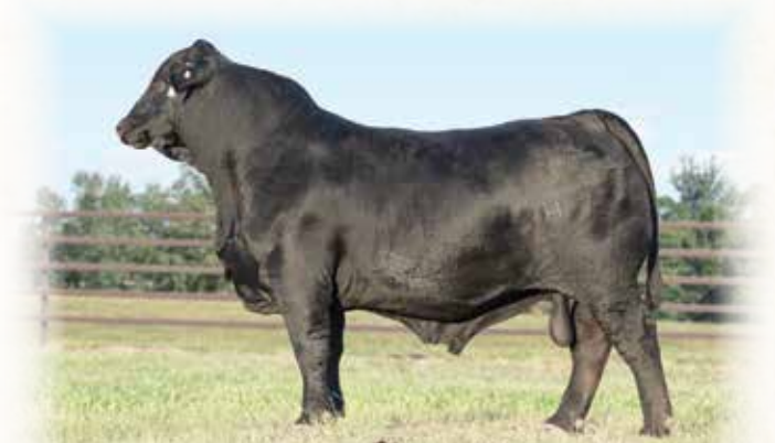
QVF INVINCIBLE 30H7