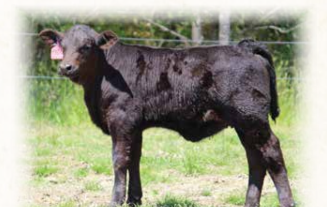
Lot 55A - DS MS EMPOWER 107K4

We think this young heifer has a huge future. Check out her top 1% REA EPD.