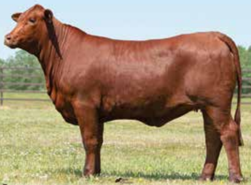
Lot 183 - TA MS GENESIS 26J11

3 ET full sisters out the Dos Bros 26/6 donor and by SR Genesis 75/3. All three of these heifers rank above breed average in an incredible 13 EPDs and Indexes. Their donor dam sales in the mature cow sale as Lot 137. All three sisters have been running with KR651/18 Chosen One for the past 40 days.