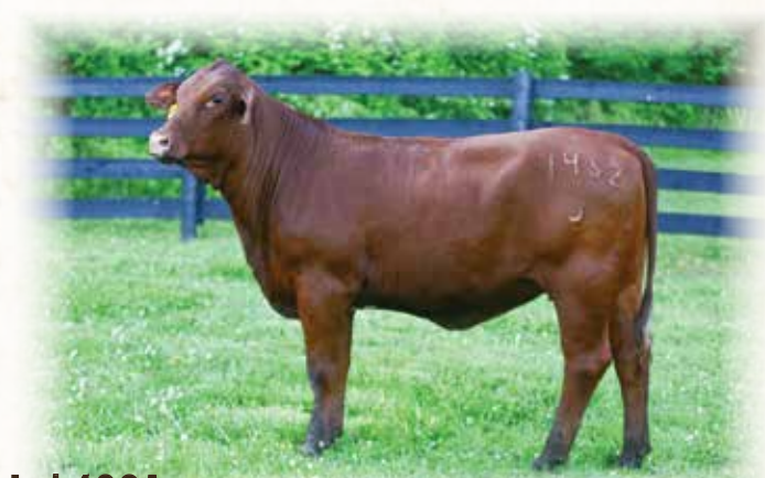
Lot 168A - QVF MS NEVER BETTER 1452J

A tremendous Never Better heifer ranking in the top 35% for 10 EPD and indexes including top 30% Milk.