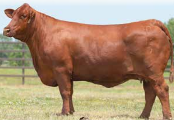
Lot 107 - SR 72/7

SR 72/7 is a tremendous cow that has proven herself both in our herd and the Strait herd. We selected her and her Catalyst daughter as two of the best in the 2021 Strait ranch sale. Great balance in EPDs and a tremendous phenotype.