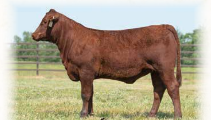
Lot 123A - QVF MS SURGE 128J