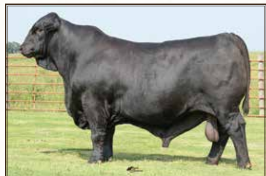
T3 Modelo 129H4 Service sire to Lots 85 & 86