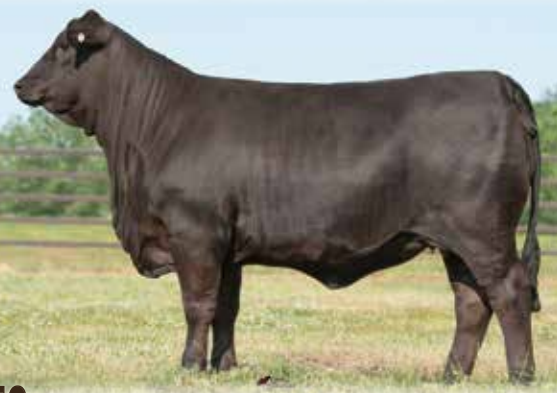
Lot 50 - MS SALACOA N SURRENDER 240J2

MS Salacoe Never Surrender 240J2 writes 12 EPD and indexes in the top 35%. Her dam 240F5 has a 358 day average calving interval after 3. 240J2 was selected out of 200 head in her contemporary to be IVF collected. She is a donor. ACE IS RETAINING THE RIGHT TO ONE IVF COLLECTION RESULTING IN AT LEAST 6 VIABLE EMBRYOS