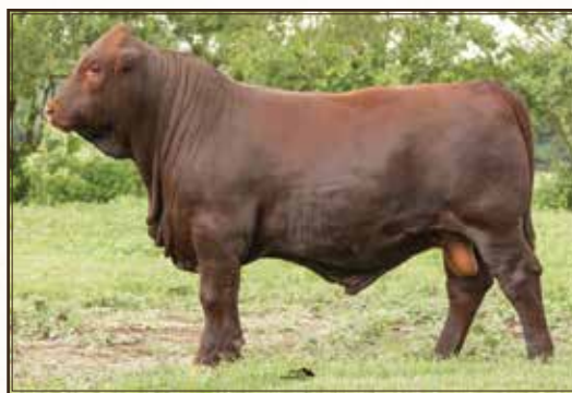
CB Nitro 46/18 Sire of Lot 187