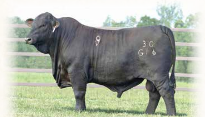
AI sire to Lots 5 & 7 - QVF EMPOWER 30G16

BWCC MS Bouncer 458C is the dam of the incredibly exciting young herd sire BWCC Papillion 458G. Papillion's first calves are weaning and they are topping their contemporary groups. 458C is a unique breeding peace. Her top 1% CED and negative BW along with a top 3% Milk, REA & IMF sets her up to improve any herd sire out there.