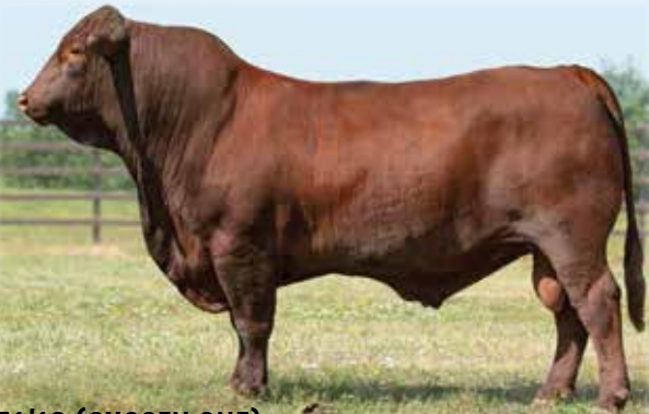
KR651/18 (CHOSEN ONE)