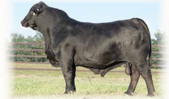
Service sire to Lots 30 & 32 - QVF INVINCIBLE 30H7

DDF PE to QVF Invincible 30H7 (10438677) 1/26/22-4/15/22, Never Surrender of Salacoa 803D9 (10318185) 4/27/22-6/10/22. Average balanced EPD's. 78D3 is an easy keeper and milks well when she calves.