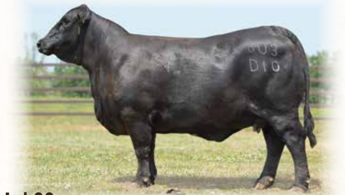
Lot 36 - MS SALACOA BOULDER 803D10

Full sister to Never Surrender. What a package. Check her perfect udder. 803D10 records 12 calves in the registry, Hhistory should be made on the spot.