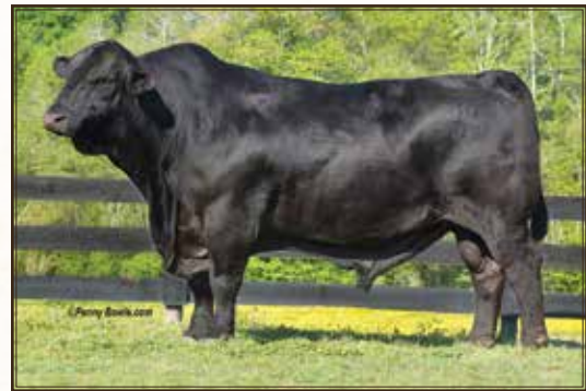
Csonka of Brinks 30R4 Sire of Lot 83