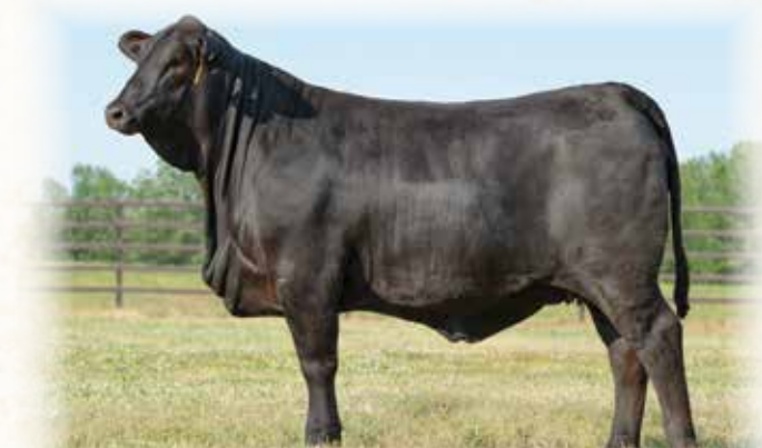
Lot 43 - MS SALACOA BROADWAY 541J49