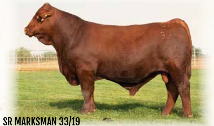
SR MARKSMAN 33/19