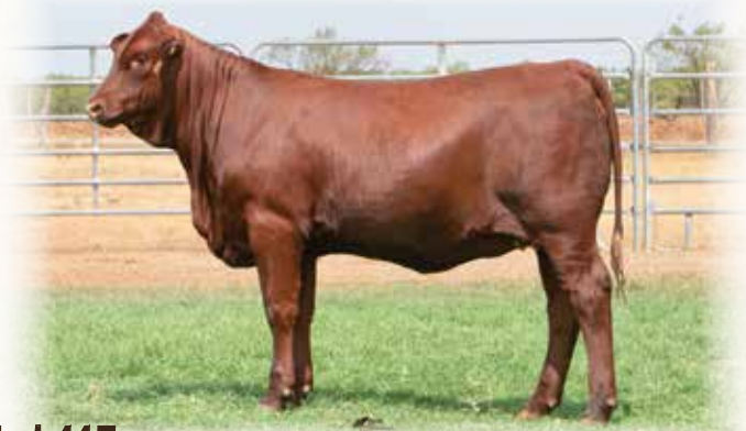
Lot 115 - SR 114/18 (PICTURED AS A HEIFER)

Here is another chance to own a young Catalysts x Mason daughter. SR 114/18 puts it together with phenotype and EPD's about as well as any in the sale. This young donor will make you famous.