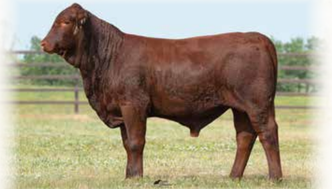
Lot 153A - QVF GENESIS 82J4