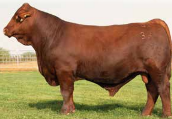
Sire of Lot 131A, Service sire to Lots 130 & 132 SR MARKSMAN 33/19

Another of our Wendt females with incredible EPDs ranking in the top 40% for 13 of 15 EPD traits including a top 25% Milk that everyone is chasing to inject in their herd. Sells with stout Data Driven bull calf at side.