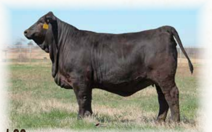
Lot 80 - MS BC MAJESTIK BEACON 535J4