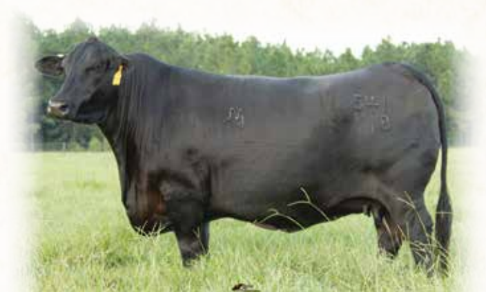
Dam of Lot 29 - MS DMR NUFF SAID 541Y18