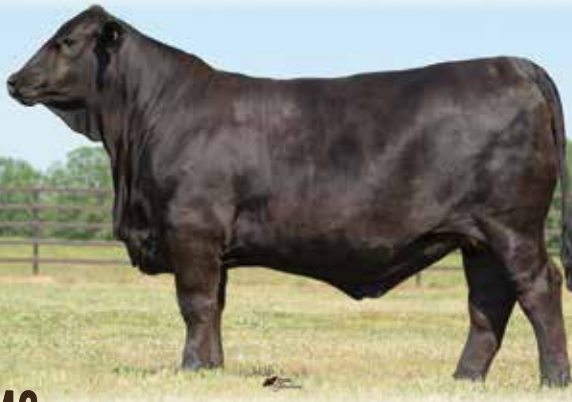
Lot 46 - MS SALACOA N SURRENDER 541H47

PE to DMR Kingdom 535G45 (10434685) 3/1/22-4/15/22, By Design of Salacoa 406F10 (10396325) 4/27/22-6/10/22. MS Salacoa Never Surrender 541H4 is out of Oaks MS Atlanta 541C53 that sells in this sale as Lot 74. 541C53 has generated over $100,000 in progeny in both her sons and daughters. When you talk about POWER this family exemplifies it to the tee! 541J32 post a 107 YW EPD with a .89 REA! Her phenotype of big bone and foot is second to none. ACE IS RETAINING THE RIGHT TO ONE IVF COLLECTION RESULTING IN AT LEAST 6 VIABLE EMBRYOS.