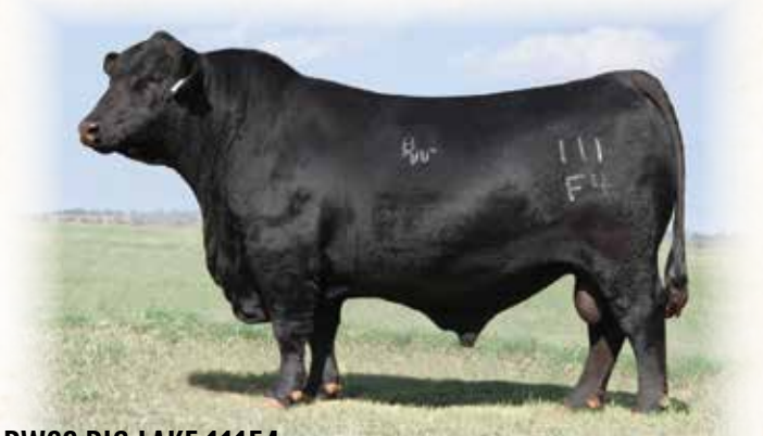
BWCC BIG LAKE 111F4