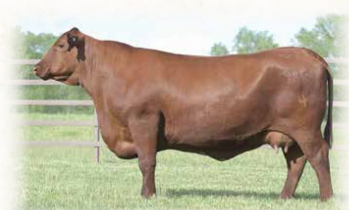
Maternal sister to Lot 180 - SILVA 915/3

Tremendous pedigree, phenotype and EPD combination. She records top 2% TM, 3% Marbling, 5% Milk and CW, 10% REA and YW and 15% WW and HP. She is also deep bodied with plenty of style and look. She is a full sister to Silva 915/3 who is questionably one of the highest dollar generating cows in breed history producing over $300,000.