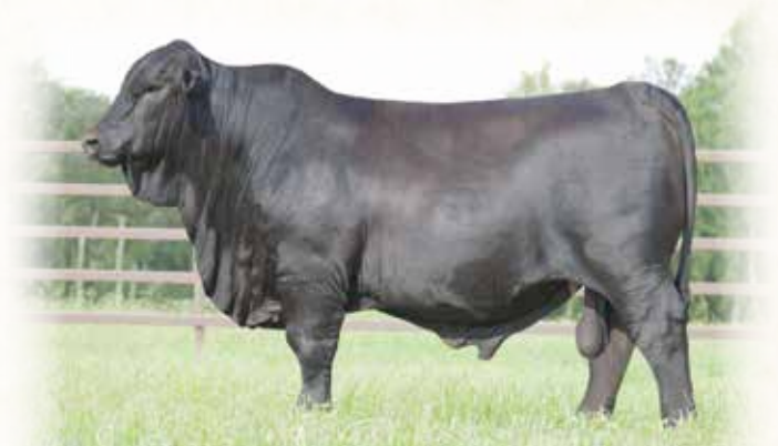
QVF SENSATION 30G17