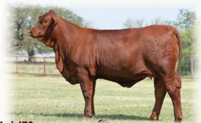
Lot 178 - MS HARRIS CHOSEN 117J3

Harris 117J3 is a prime example of SGBI Sire of the Year KR651/18 Chosen One's progeny. She checks all the boxes. Great phenotype along with a tremendous EPD profile. She post 12 EPDs and indexes in the top 30% including top 2% Milk that everyone is trying to inject back in their herds. Harris Riverbend will reserve one IVF flush resulting in at least 6 embryos.