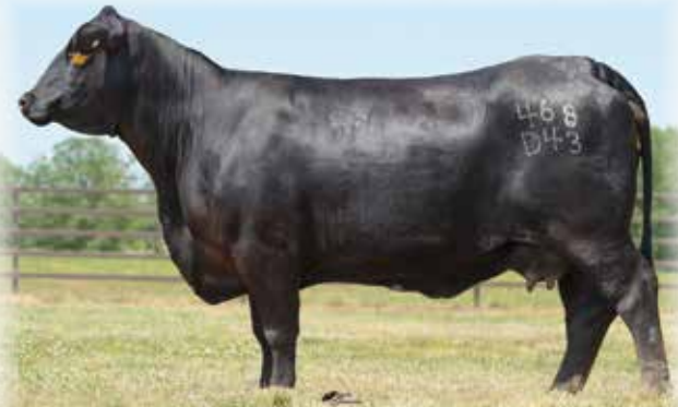
Lot 27 - MS SALACOA LEGACY 468D42

468D43 blends a top 15% Milk with a top 15% REA. She has generated over $57,000 in revenue.