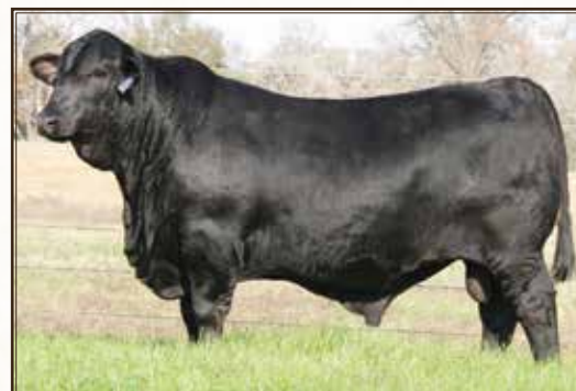
MC Sho Time 313H30 Son of Lot 1