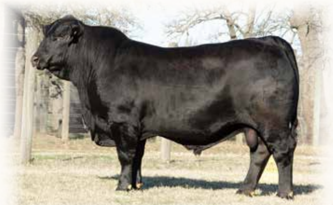
Sire of Lot 74A - BRIGGS GULF COAST 23F5

Show stopper heifer calf out of our $20,000 Never Surrender son Briggs Gulf Coast.