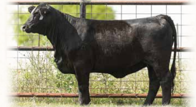
Lot 70 - TJR MS CROSSFIT 924/H6

Combining Cross Fit and the famed 924 cow family these are Truly royal genetics. This female combines a show stopping look with numbers and a very desirable pedigree. She is top 10% SC, 15% WW, 20% IMF and 25% YW and Term Index. When you see this heifer and consider her breeding and the potential of a calf by the $115,000 Black Water bull you will agree she is the real deal.