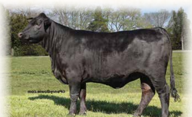
Lot 83 - CCR LADY ATLANTA 1912H4

This ET flush heifer comes straight from the heart of our top replacement female fall 2020 crop. 1912H4 is sired by the superstar of balance, Atlanta of Salacoa 488Z, her dam is the exciting $34,000 Cold Creek Lady Passport 1912C, now owned by Elias Brangus. Like her dam, she possesses impeccable phenotype and genetics. 1912H4 will impress you with her length, volume, and dimension. She projects an outstanding and extremely unusual 12 EPD traits in the breed's top 30% or greater, including Term Index 10% and Fert Index 10%. Her outcross genetics go back to the infamous "Lady" family of Angus cows which have generated over $10 million in sales, are known worldwide for their fertility, and from which we formed the 1912 Brangus cow family. 1912H4 took to her first AI and is safe in calf to one of the hottest sires in the breed today, BWCC Big Town 192B16. The EPD projections for the calf from this breeding produce thirteen top 35% or greater traits. This "Lady" is an incredibly special donor prospect in every sense of the word. Don't miss your chance to jump on the 1912 freight train and add these exciting new outcross genetics to your herd. Join the new Brangus herd legacy!