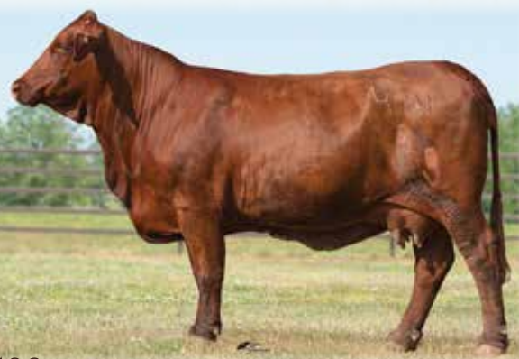
Lot 108 - HISS 414/6

Hiss 414/6 has been a nice cow for us. Sells with a really good heifer calf at side by Never Surrender.