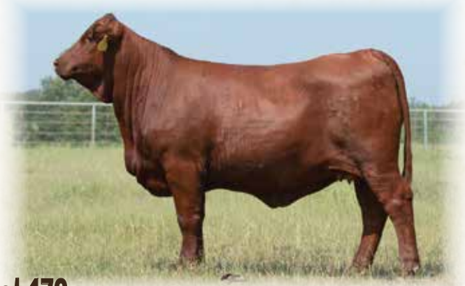
Lot 170 - WR 477H

A daughter of Red Doc EL Hombre 6279 and out of own daughter of Grizzly. You can't find these bred like this anymore. She ranks in the top 35% for 11 EPD traits including Milk with a top 15% Marbling and top 20% REA.