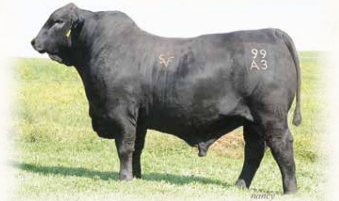
Sire of Lot 18 - BIG CYPRESS OF SALACOA 99A3

A very powerful Big Cypress daughter. Top 10% Millk.