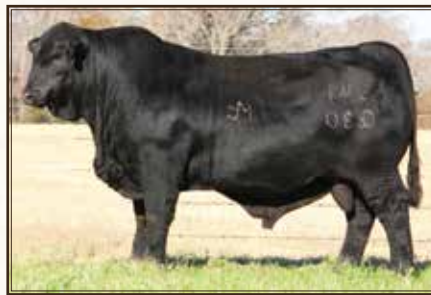
MC Five Star 541G30