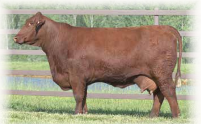
Dam of Lot 153 - HARRIS 82/4

A full sister to Lot 152 QVF Sancho 82G3 ranks in the top 30% for 11 EPD traits and indexes. Selling with her nice Genesis bull calf at side.