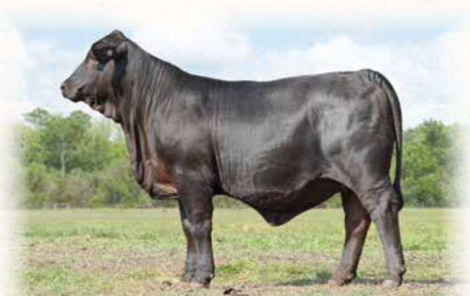
Lot 85 - T3 MS EMPIRE 30J20

T3 MS Empire 30J20 is out of one of our "30D" daughters, T3 30G and that sold to Star G for $18,000 in the 2020 ELITE sale. She post 8 EPD traits and Indexes in the top 35% including the most important BW, YW, SC, REA, IMF and HEIFPREG. Like her donor dam and Grand dam we think 30J20 will continue the "30" cow family legacy and produce top shelf Brangus. AI bred on 5/17/22 to T3 Modulo 129H4.