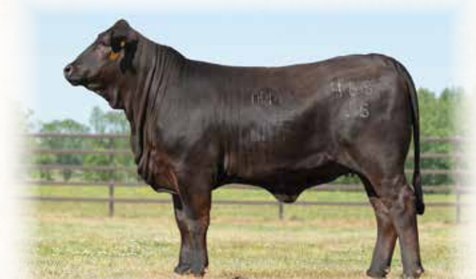
Lot 60 - ABF MS THREE D 468J5