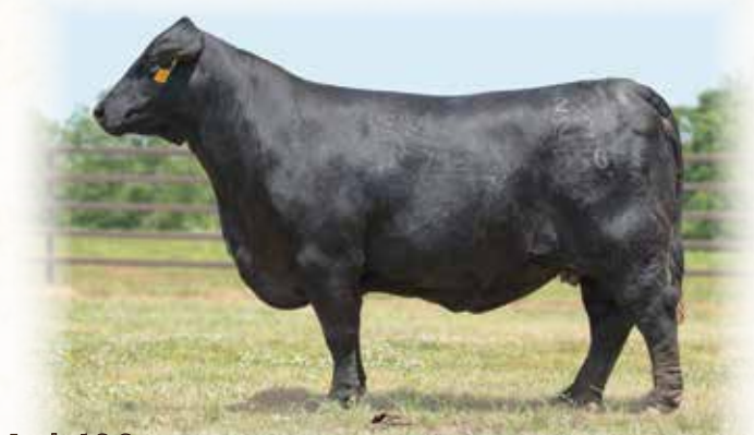
Lot 138A – QVF MS NEVER BETTER 1425J