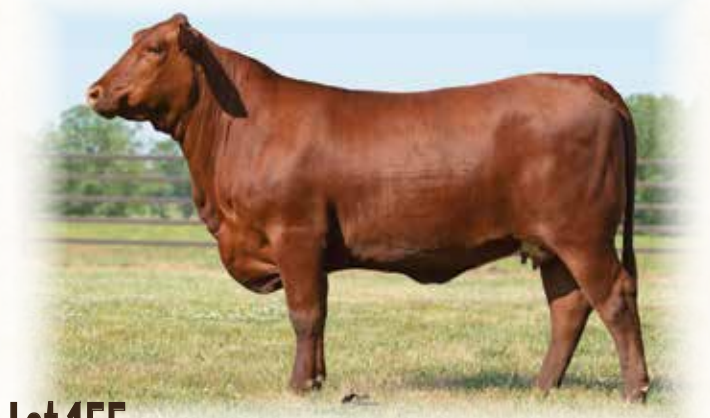
Lot 155 - QVF MS NAVIDAD 915G10