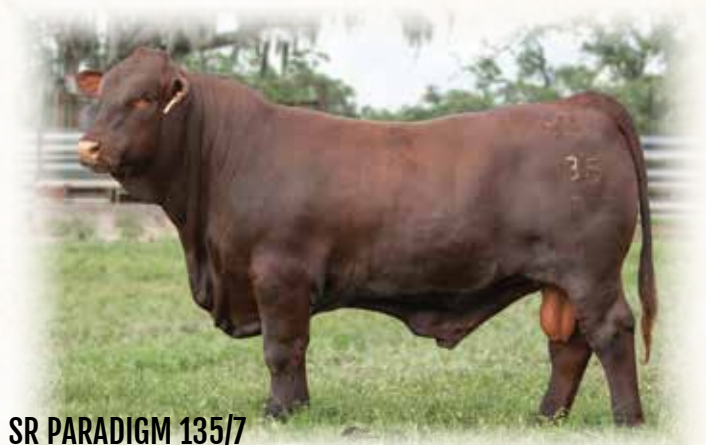
SR PARADIGM 135/7