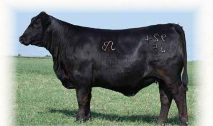
Lot 90 - SB MS CROSSCUT 924J5

They asked us to bring an ELITE female and so we reached to our very best in SB MS Crosscut 924J5. She is right out of our top pen. She writes 9 EPD and Indexes in the top 35%. Her donor dam RBM MS RESET 924D8 is our primary donor. She has 18 calves in the IBBA registry. They say donors are produced by donors. Well 924J5's dam is a donor, her grand dam was a donor and her great dam is the legendary Brangus breed changing donor MISS NMSU 924.