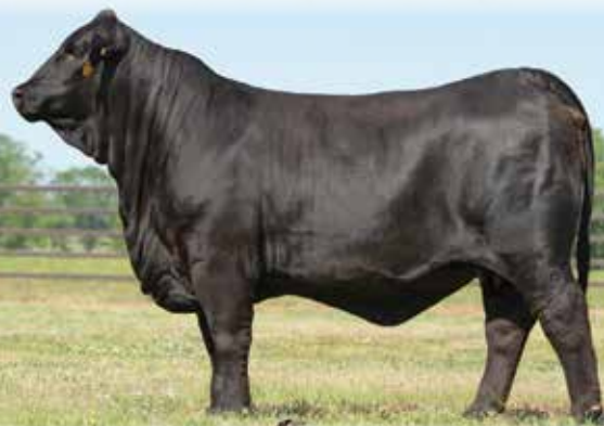
Lot 48 - MS SALACOA BRICKHOUSE 535H30

MS Salacoe Brick House 535H30 lines up two of the most used AI sires in the breed in Brick House and Majestic Beacon. She post top 1% WW and YW EPD's. ACE IS RETAINING THE RIGHT TO ONE IVF COLLECTION RESULTING IN AT LEAST 6 VIABLE EMBRYOS.