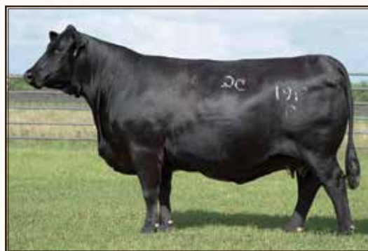
Cold Creek Lady Passport 1912C Dam of Lot 83