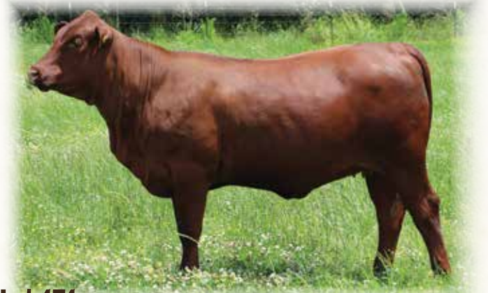
Lot 171 - TIDELAND 124

Choice or times two on these heifers that were picked from our keepers. TL 124 our Red Doc Diner 4088 son, Red Doc 7229 and a tremendous Harris x Creel cow. She has tremendous phenotype with her smooth look and pretty front end.