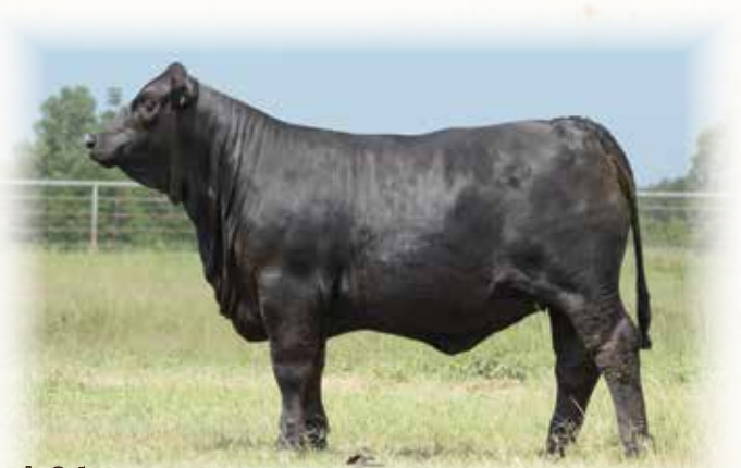
Lot 81 - CN MS TRINITY 415H12