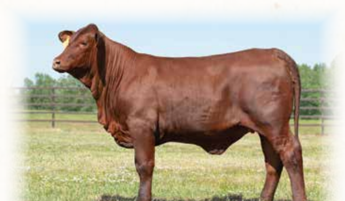
Lot 159 - JERNIGAN 15/21

She ranks in the top 35% for 10 EPD traits and indexes including top 15% WW, YW, TM, Balanced, Cow/Calf and Terminal. 15/21 also has a breed average Milk to go along with a top 30% REA and Marbling EPD. We have been in the business many decades and when we come to a sale like this one we bring our very best and 15/21 is just that.