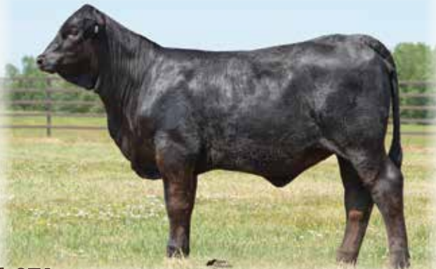
Lot 27A - QVF MS N SURRENDER 468J40